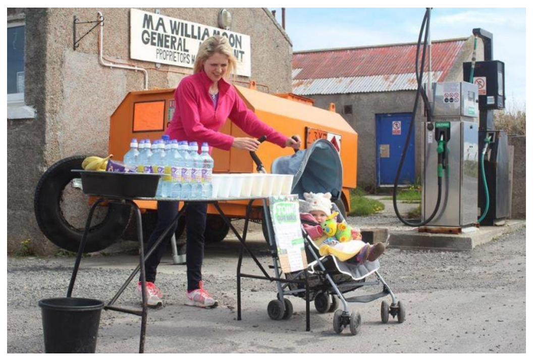
Olivebank "pit stop" ready for action