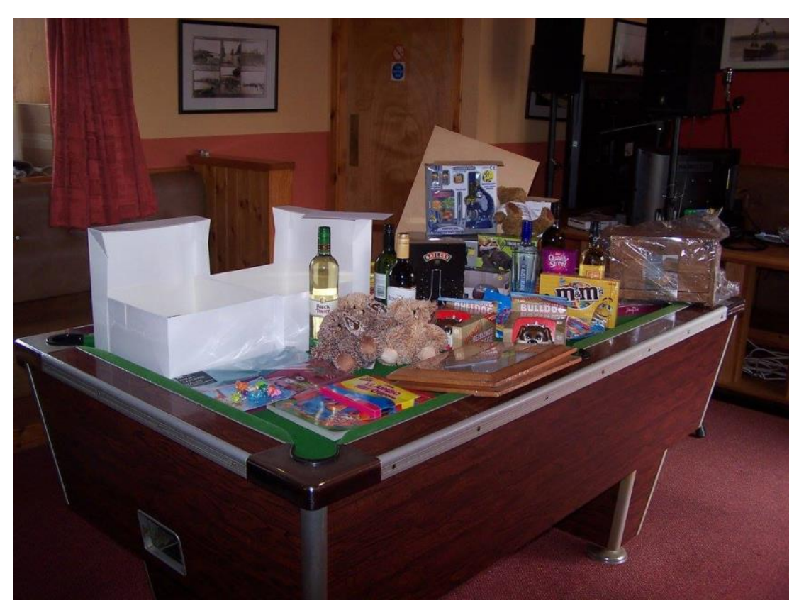
Raffle prizes waiting at the hotel