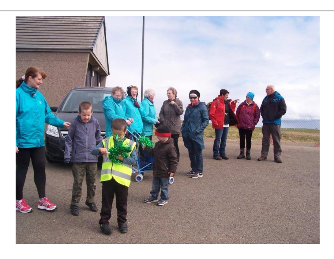
Two mile starters gathering at the school