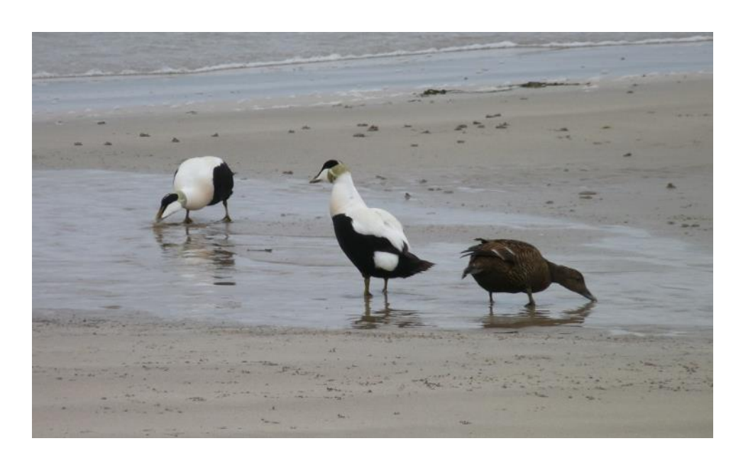
8) Eiders at Bomasty Bay, mid-May 2016.

The previous day we had been asked if Eiders (and other 'sea-duck') drank fresh water or 'made do' with salt water. We were not sure and had certainly never seen Long-tailed Duck on the beach although Eiders are often seen 'ashore'. We felt that they must drink freshwater and the following day this was confirmed when we came across a group of Eiders drinking from the freshwater stream which runs down from the Rothieshom Moor and into the sea at Bomasty. Problem solved!'