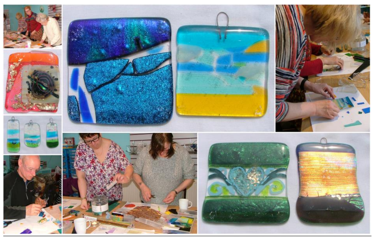
Glass fusion workshop