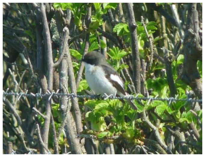
2) Male Pied Flycatcher in full summer-plumage.

1) Garganey at the Blan Loch, early May – female's head can just be seen to the left.