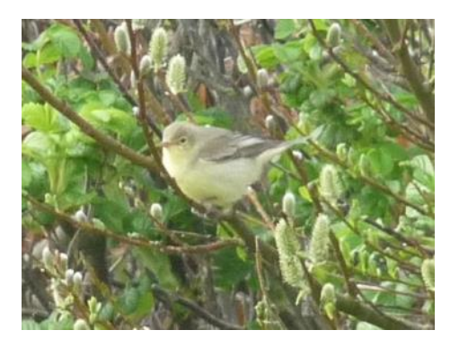
6) 'Icterine Warbler at Gesty Dishes. (A pair nested in the Lower Millfield garden in 2002).'

5) Garden Warbler at Harrowdale – nothing duller than this species!