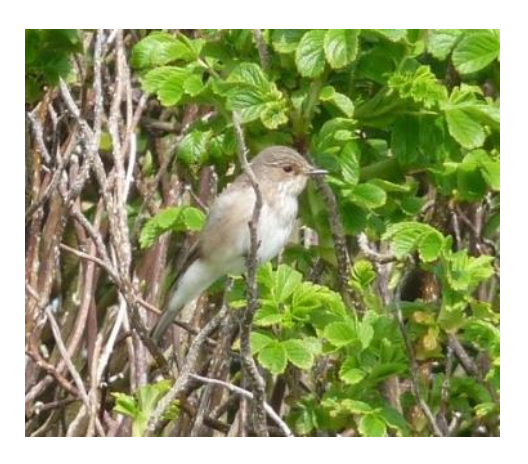
3) Spotted Flycatcher – dull at all seasons!