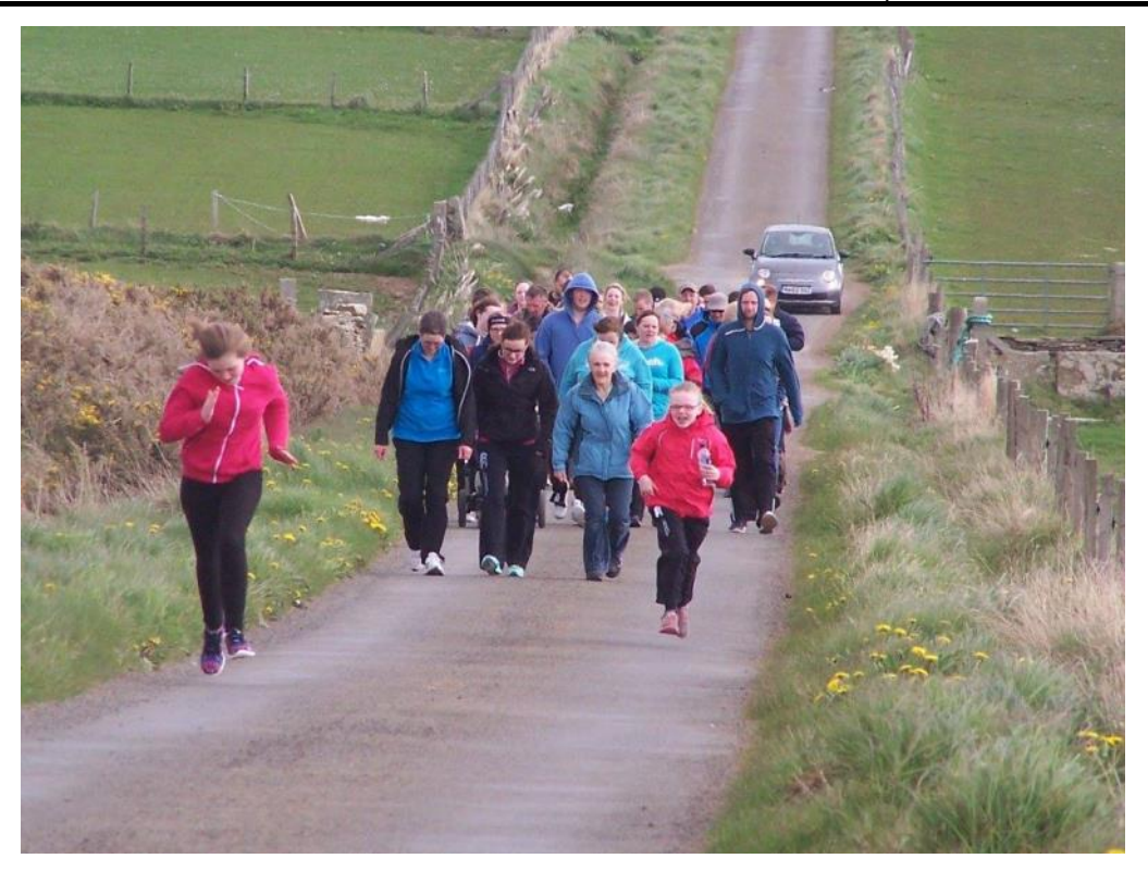
Five mile starters