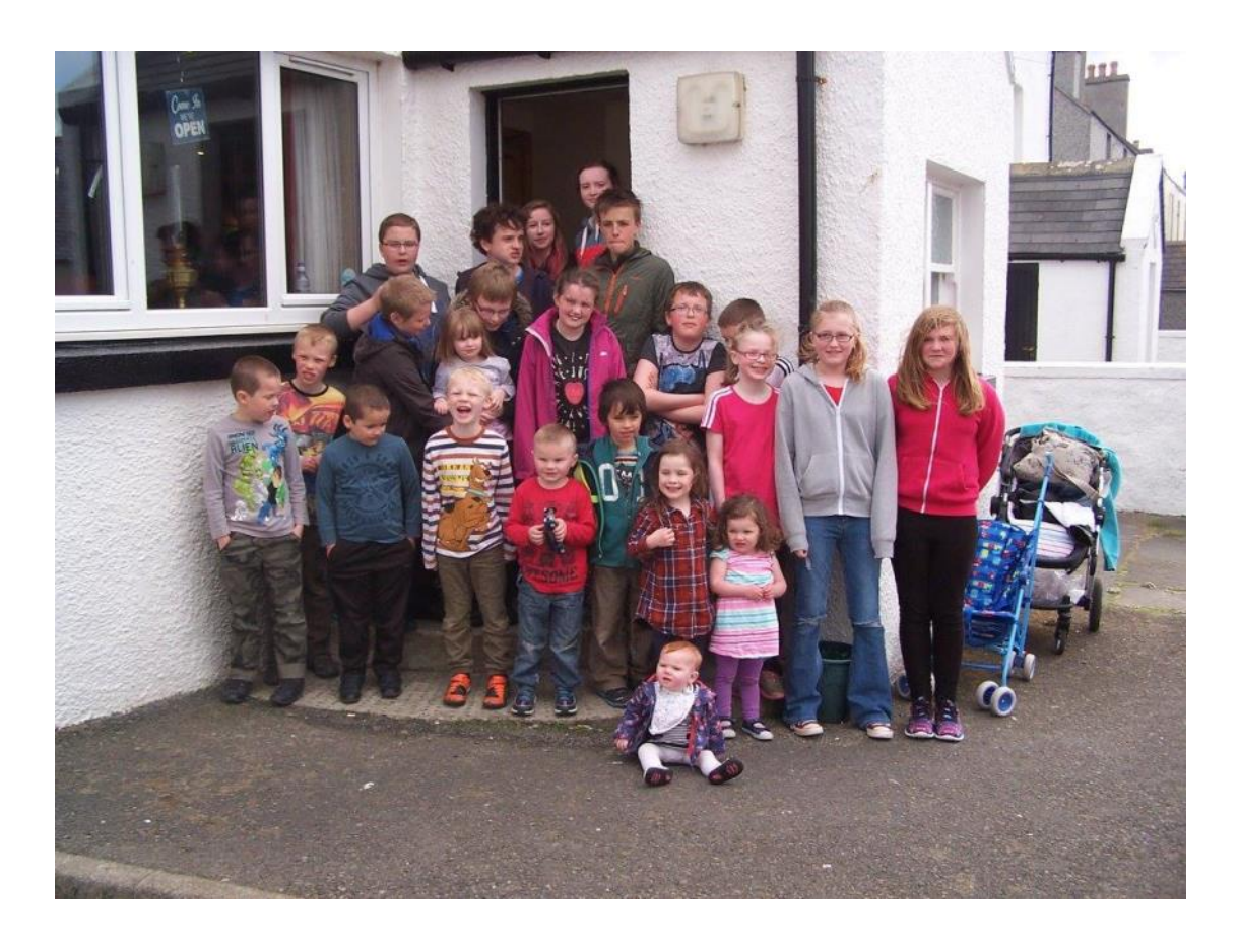
Some of the younger walkers