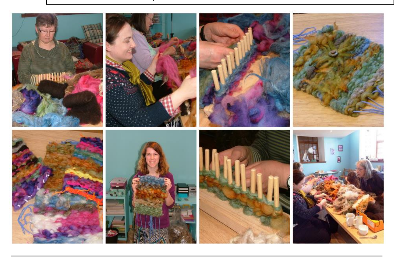
Peg loom weaving workshop