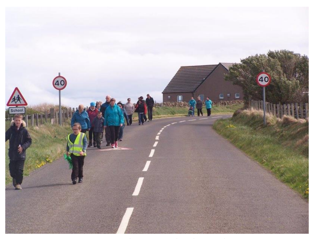
Two mile starters hit the road