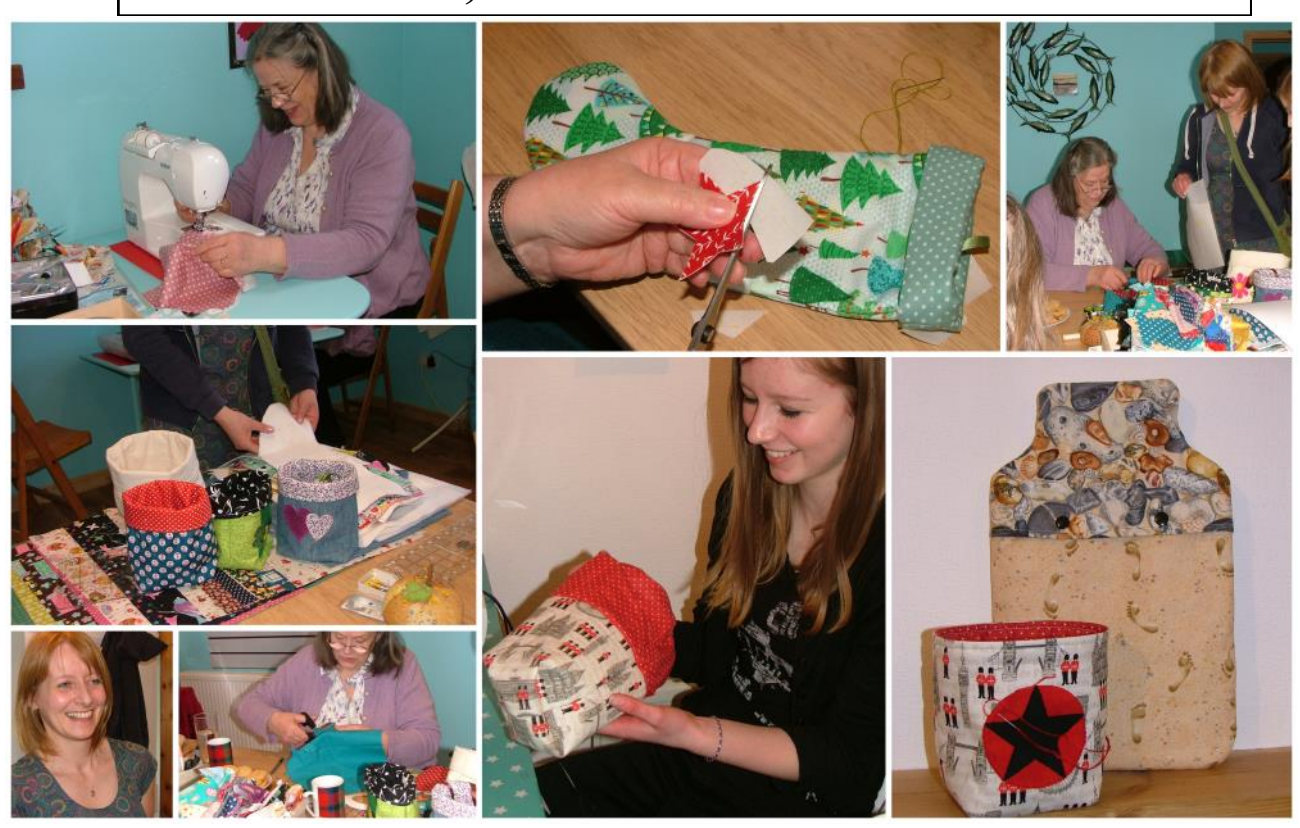
A "stitch up" workshop