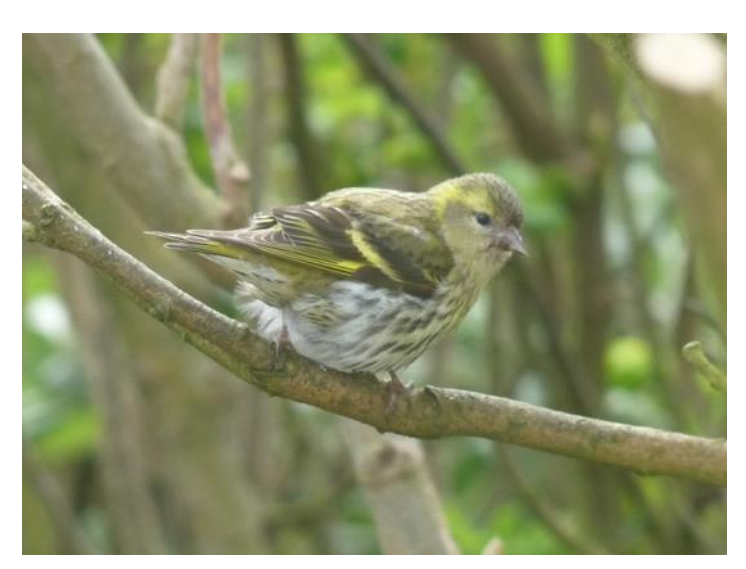
7) Siskin in the Castle garden.'