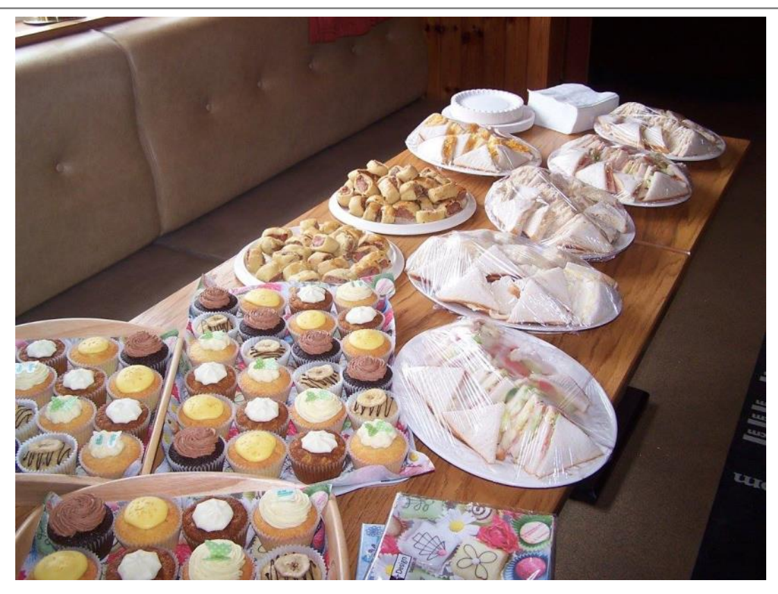
Refreshments waiting at the Stronsay Hotel