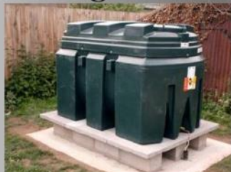
Oil Tank Installation