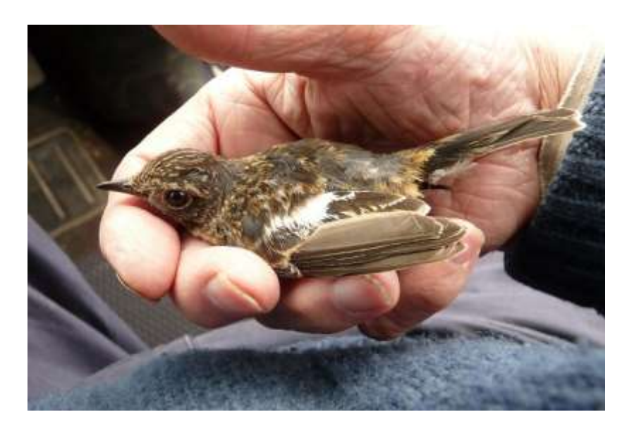
'The juvenile Stonechat – a very lucky bird!'

Wheatears began to arrive from the NW in light westerly winds mid-month and the first small 'woodland' bird to arrive was a Willow Warbler in the garden at Gesty Dishes on 15th (Ant and Clare). A real surprise occurred on 18th while Norman and Hazel were driving along the road near Mt Pleasant after a walk along the Rothiesholm Beach. Sud-denly a small bird flew into the car through the small gap above an open window. It was quickly picked up – just before Sue and I arrived – and turned out to be a juvenile Stone-chat (see photo). The bird had almost certainly fledged on Eday where several pairs breed annually, and had probably just escaped the talons of a Merlin (or other small bird of prey), by taking cover in the car. The bird's feathering was a bit dishevelled but there appeared to be no other damage and it was released near the Fire Station a few minutes later.