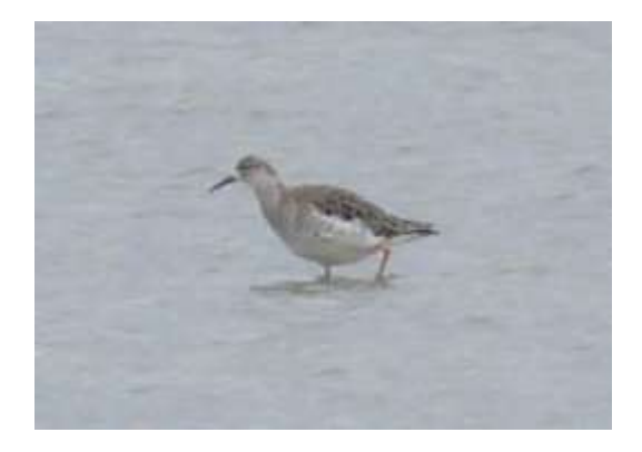
'Male Ruff at the Bu Loch mid-August'

Wheatears began to arrive from the NW in light westerly winds mid-month and the first small 'woodland' bird to arrive was a Willow Warbler in the garden at Gesty Dishes on 15th (Ant and Clare). A real surprise occurred on 18th while Norman and Hazel were driving along the road near Mt Pleasant after a walk along the Rothiesholm Beach. Sud-denly a small bird flew into the car through the small gap above an open window. It was quickly picked up – just before Sue and I arrived – and turned out to be a juvenile Stone-chat (see photo). The bird had almost certainly fledged on Eday where several pairs breed annually, and had probably just escaped the talons of a Merlin (or other small bird of prey), by taking cover in the car. The bird's feathering was a bit dishevelled but there appeared to be no other damage and it was released near the Fire Station a few minutes later.