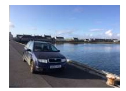
Page 14 of The Stronsay Limpet - Issue 170-August 2019