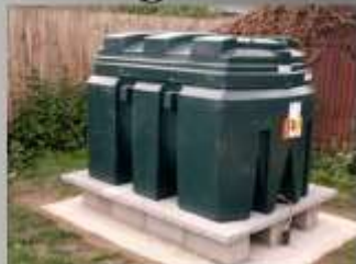
Oil Tank Installation