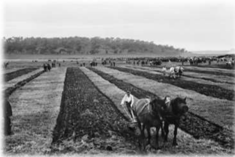
A horse ploughing match in progress