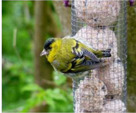
'Male Siskin – typically on a feeder – in the Castle garden.'