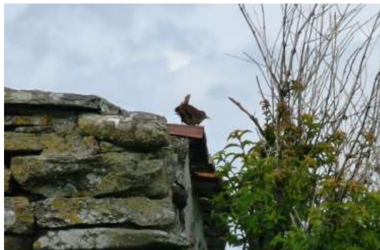
'A familiar sight – perfectly posed with cocked tail – the tiny Wren. The most widespread species in the UK'