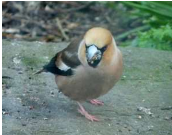
'Yes – that bill can draw blood if handled!'