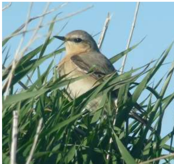
'One of the Wheatears heading for Greenland in the Reserve drive.'