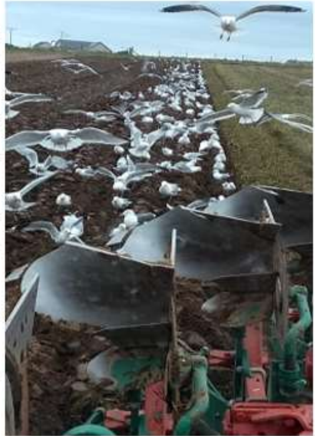
The newer style of plough leaves a much more broken furrow

As the years passed, new styles of ploughs appeared and, with the advent of shear pins and trip-leg ploughs, the potential damage that could be caused by hitting a rock was reduced and consequently ploughing speeds could be increased. The invention of the reversible plough was also something of a landmark in the progress of ploughing as land no longer needed to be ploughed round and round in rigs. With one set of 'right hand' mouldboards and one set of 'left hand' boards on the same plough, it was possible to start at one side of a field and work across to the other side, meaning more efficient ploughing and a flatter surface, with no 'feerings' and 'finishes' to contend with. In the last 100 years or so we have moved from the horseman with his team ploughing an acre a day to the point in 2005 where a 500-horsepower tractor complete with a 20-furrow reversible plough set a new ploughing world record, with 44.5 acres being ploughed in one hour and an unbelievable 793.6 acres of ground being turned over in 24 hours. That is the equivalent in size to about 530 football pitches!