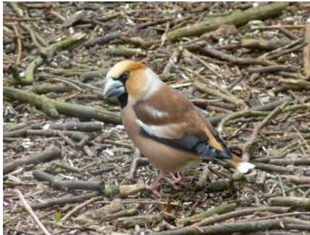
'Male Hawfinch in the Castle garden, late April.'