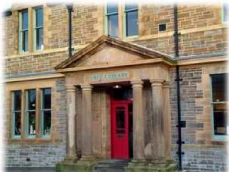
The Library in Laing Street which served the people of Orkney for well-nigh a century.

appeal for books and donations resulted in the receipt of around 200 books and £70 in cash and, with the incorporation of the “Bibliothek of Kirkwall”, the “Orkney Library” as we know it today had its beginnings. A gift of money from Andrew Carnegie in 1889 enabled the library to buy a large and varied selection of new books and, with this influx of new material, many of the older books were deemed as surplus to requirements. These books, including nearly all those from the original “Bibliothek of Kirkwall”, were sold by public auction in 1891.