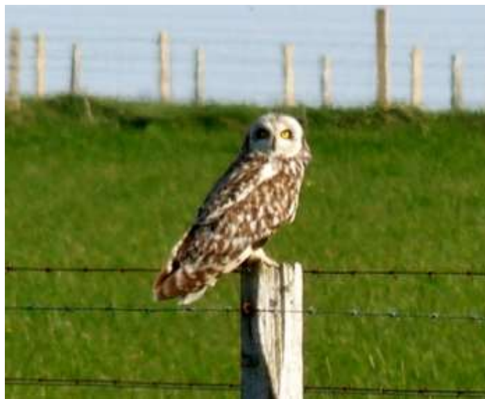
'Short-eared Owl near Eastbank – a favourite hunting area for the species.'