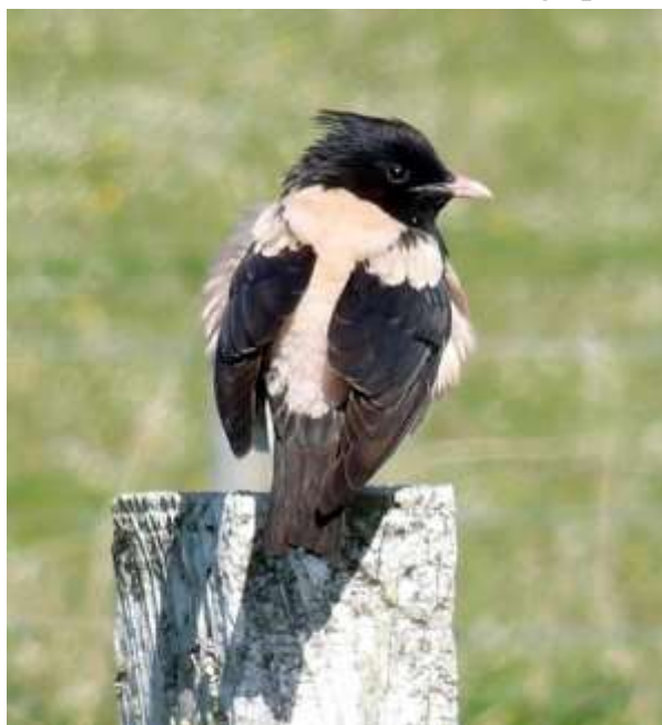
'Rosy Starling near South School.'