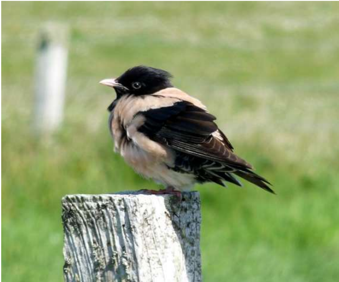
'Rosy Starling near South School.'