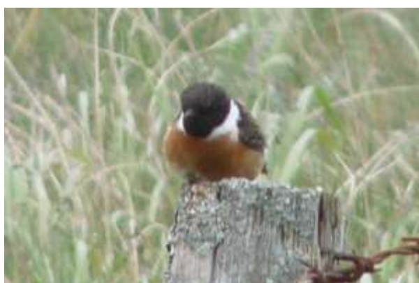
'Adult male Stonechat at Millgrip.'