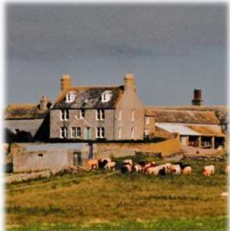
Holland Farm, where the Orkney Library had its 17 th century origins