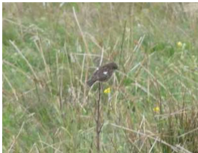
'Juvenile Stonechat at Millgrip'