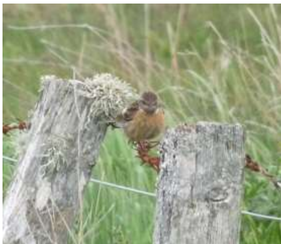
'Adult female Stonechat at Millgrip.'