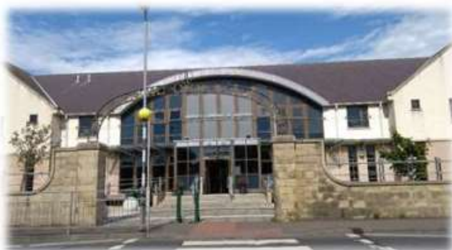
The new Orkney Library and Archive opened in 2003