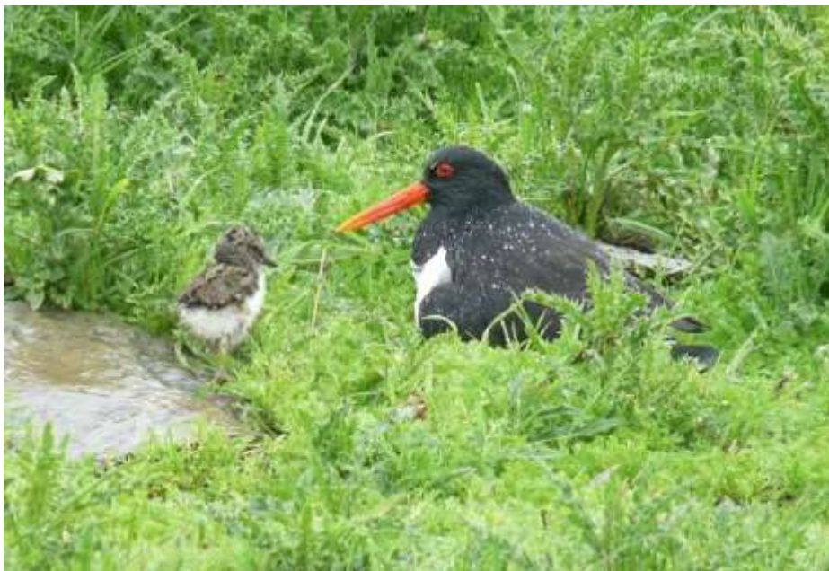
'Oystercatcher with chick by the roadside - near Roadside!'

All the photographs taken from inside the car!