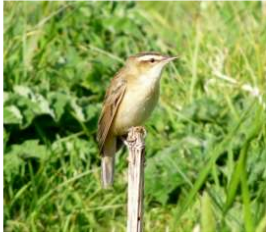
'The male Sedge Warbler in the Castle drive.'