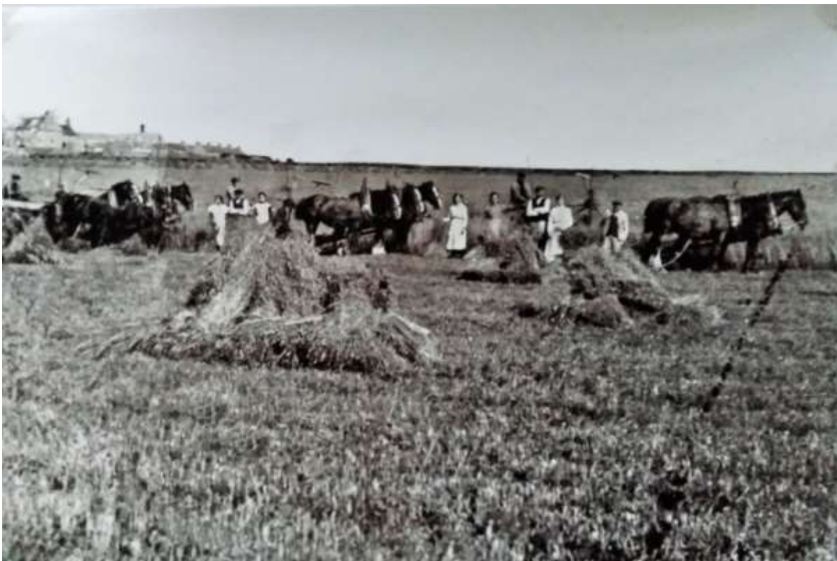
Three binders with their three-horse teams stopped for a rest. The farm of Holland can be seen in the background. The sheaves have already been set up into 'stooks' to help them dry out before being 'led' home into the stackyard and built into stacks.

Some farmers today can still be heard to speak of 'yoking time', 'lowsin time' and stopping for their 'half yoke' although, in horse terms, the events referred to would have come to an end long before they were born!