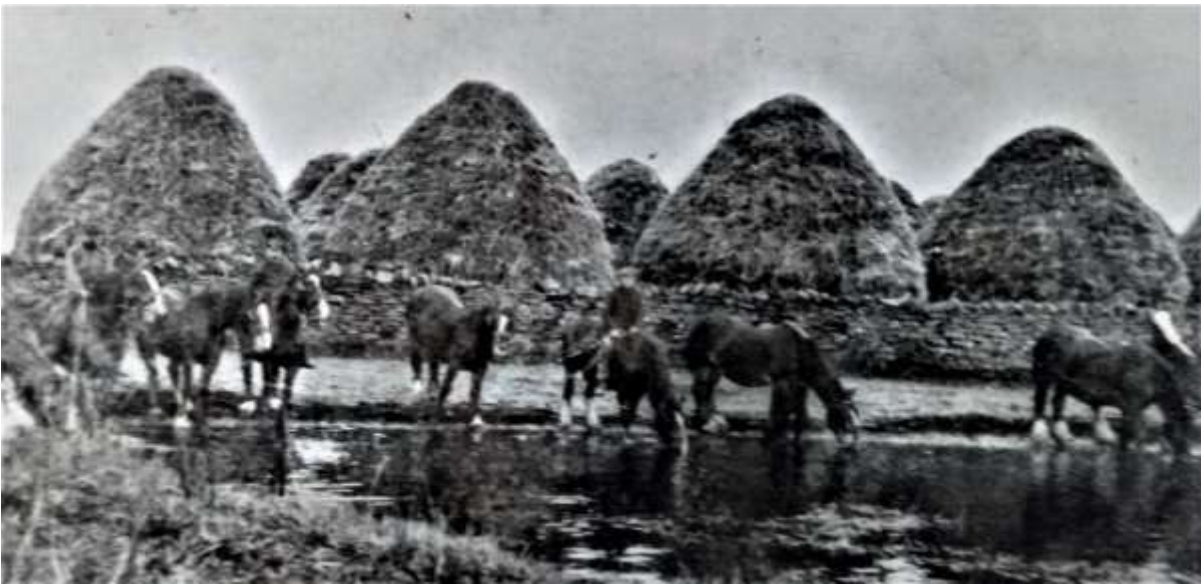
Horses having a drink at the pond at Holland Farm. In the background is what must be fairly recently built stacks as they haven't yet been secured with 'simmons' (straw ropes) to prevent them from blowing away in the winter storms.

Another of Jim's tales, related in full in issue 171 of the Stronsay Limpet, tells of the decline of the heavy horse at Holland and his successful attempt to prove that a team of horses could cut a crop of oats with a binder every bit as fast as a tractor and binder could!