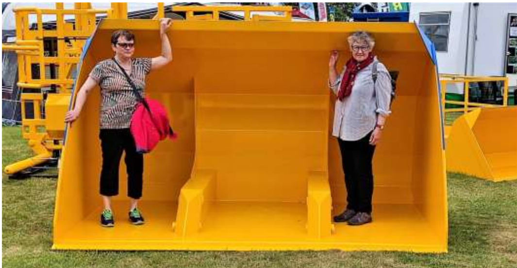
The sheer size of some of the machinery had to be seen to be believed. This was a bucket to fit on a telehandler – the models were an optional extra!

We spent some time touring the machinery stands, inspecting the livestock on show and watching them being judged, and visiting the myriad of tents promoting and selling just about everything imaginable. Some fantastic handicrafts were on show and there were also a number of competitions going on around us, including climbing an 80' wooden pole in something like 15 seconds!