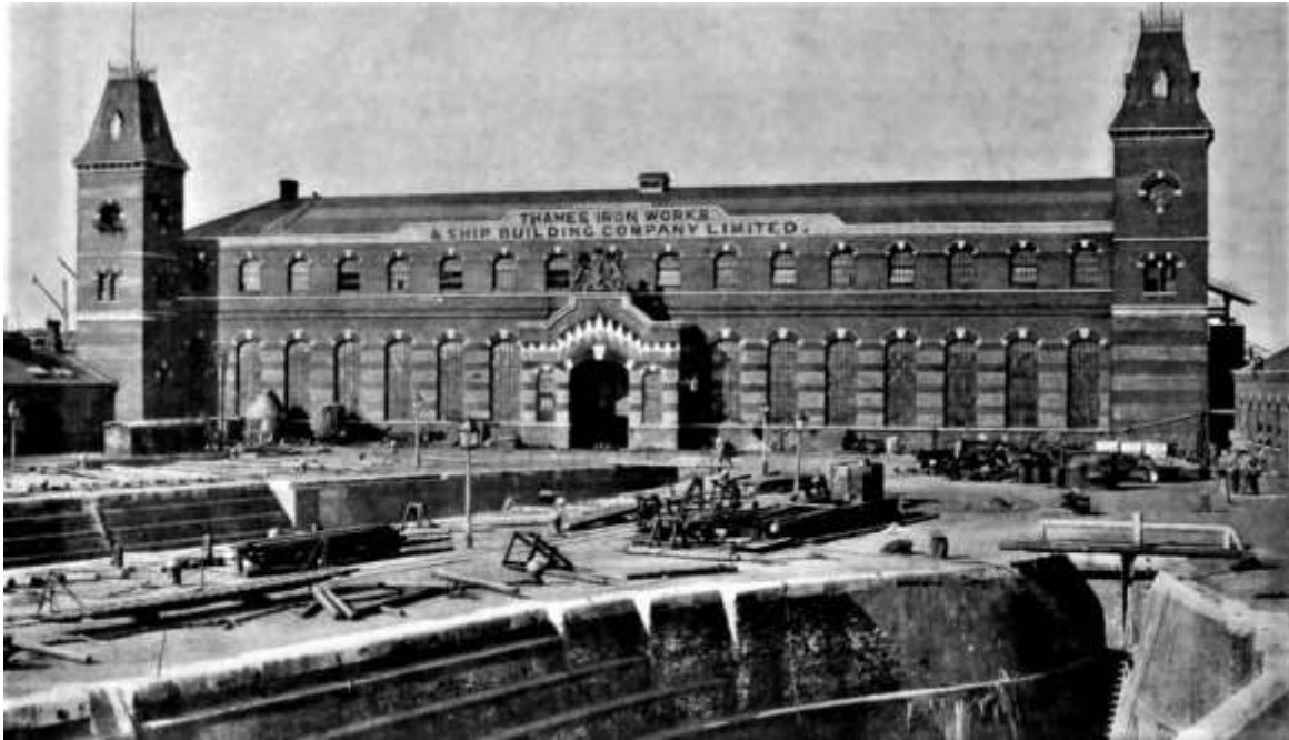
The Thames Ironworks, where many of the early RNLI lifeboats were built.