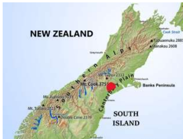
New Zealand's South Island with the Chertsey and Ashburton area marked in red