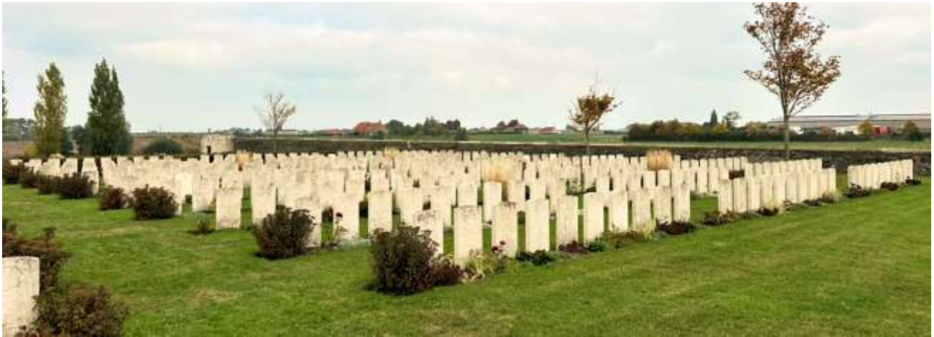
Passchendaele New British Cemetery

He then visited the Passchendaele New British Cemetery and sought out the grave of William Croy. He was rather disappointed to find that the gravestones in that area looked as if they were badly in need of cleaning but was informed by a caretaker that, in that area of Belgium, the stones were subject to attack from a type of black coloured fungus and the Commonwealth War Graves experts had as yet been unable to find a cure which could remove the fungus without damage to the stones.