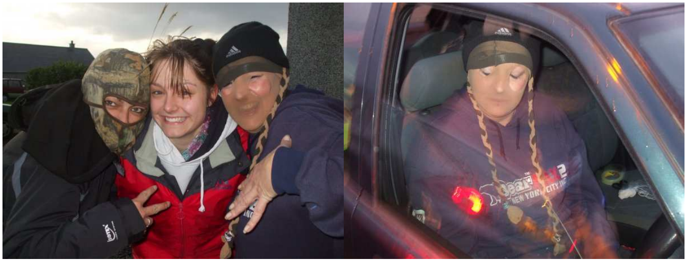
Page 12 of The Stronsay Limpet - Issue 51—September 2009

Early in the morning of 09/09/09 these suspicious characters were seen lurking around Number 3 Whitehall. They were thought to be planting flowers. Any information will be treated as confidential - contact Craig on 616428