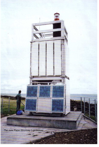
Page 10 of The Stronsay Limpet - Issue 51—September 2009