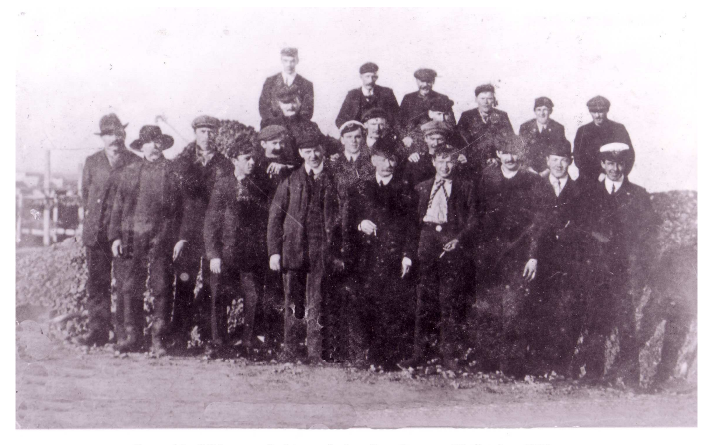
Crew of the "Edenmore", shipwrecked on Papa Stronsay, 7th October, 1909.