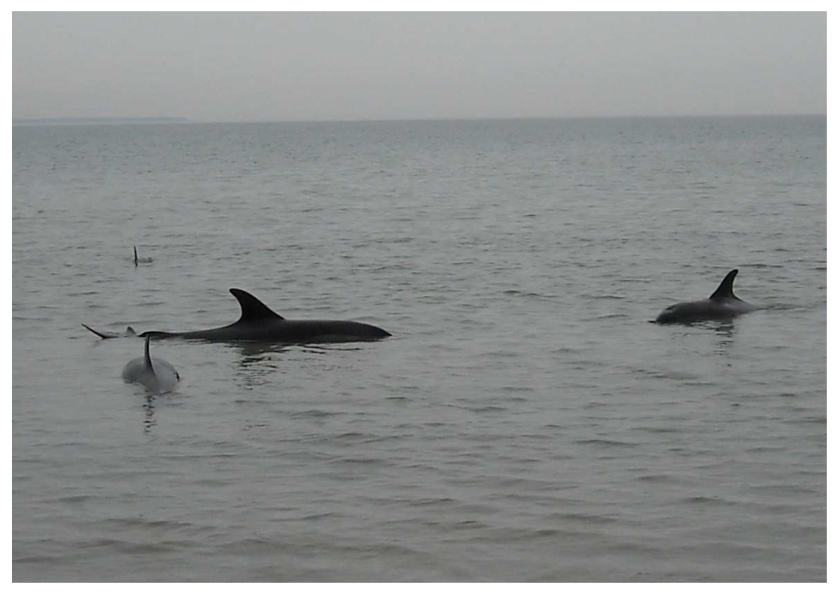
Page 6 of The Stronsay Limpet - Issue 60 June 2010

Jean and I went home to get dry but Brian stayed for an hour to make sure they did not come back in. He also checked later that evening and we checked again the next morning. We are not sure what made them come ashore, it could have been the killer whales seen off of Shapinsay near to that time. There is a dead dolphin higher up the beach near the Bu that had been there a few days previous, it may have been with them at some point.