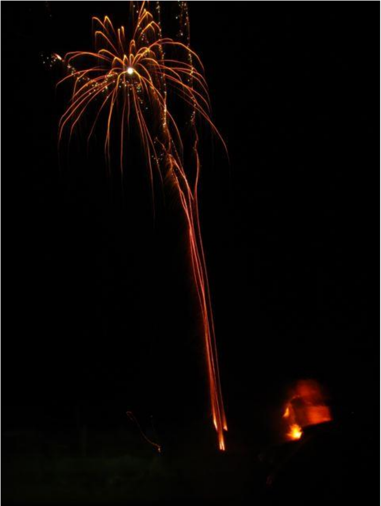
Bonfire night display, Stronsay 2 November 2013