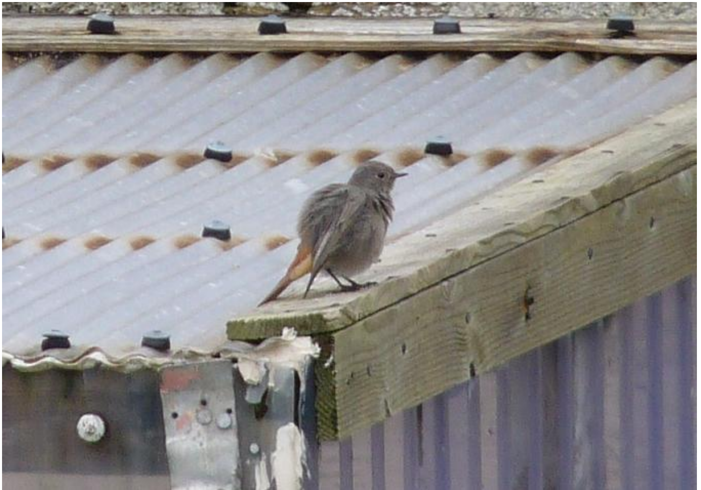
'Black Redstart Whitehall Village 2011 - similar plumage to the bird at Tullimentan in 2013'

Several Goldcrests arrived at the end of October when the only Black Redstart of the year was found by Paul and Diane at Tullimentan.