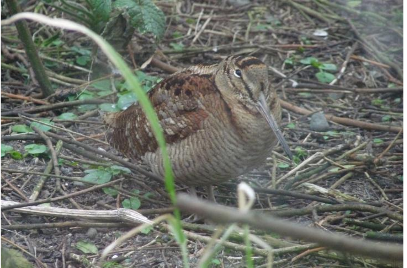
'Woodcock from the kitchen window at Castle'