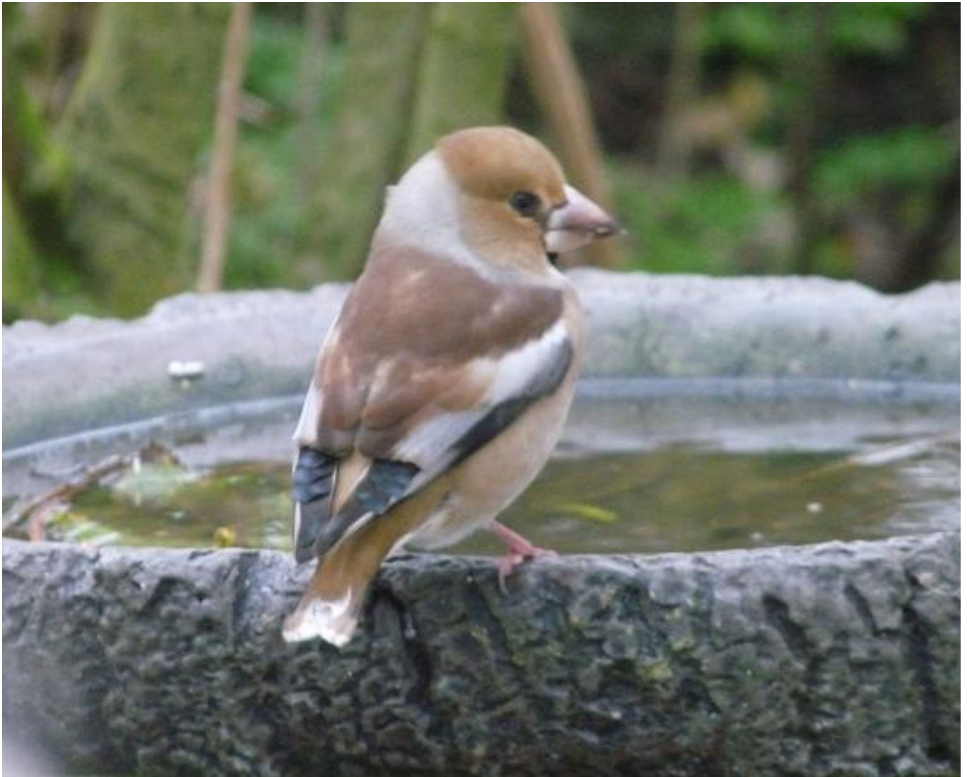
'Hawfinch in the Castle garden. Late October'