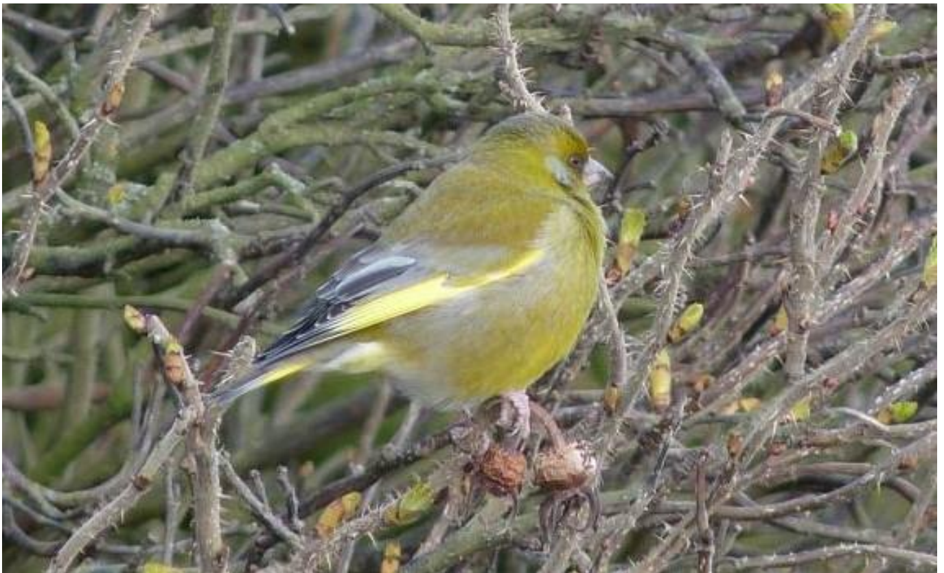
'Male Greenfinch in rosa rugosa bush'

The annual build-up of Pintail has begun at the Blan Loch (Mt Pleasant) with four beautiful males there in the last few days, and the first wintering Goldeneye have arrived - one or two off the piers at Whitehall, where a few Long-tailed Ducks and Red-breasted Merganser may also be seen in mid-Winter. At least four different Hen Harriers appear to be wintering on the island and occasionally fly across gardens in their search for prey. Common Snipe seems to be their main target and with several thousand on the island in mid-winter the harriers should have no problem finding food!