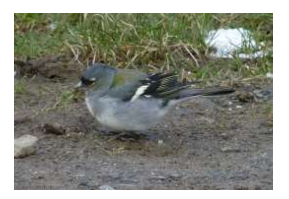
A chance visit to Kirkhall in March and there, in the drive, was this 'africana' (African) Chaffinch - just the 5th or 6th record for the UK.