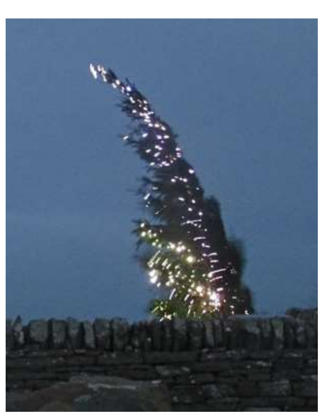
Stronsay's Christmas tree is buffeted by the recent high winds

Grimshaw (New resident of Brimskin's Home for the Pleasantly Deranged)