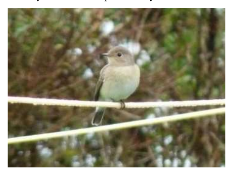
The flycatcher in The Manse garden in late September - still not specifically identified!