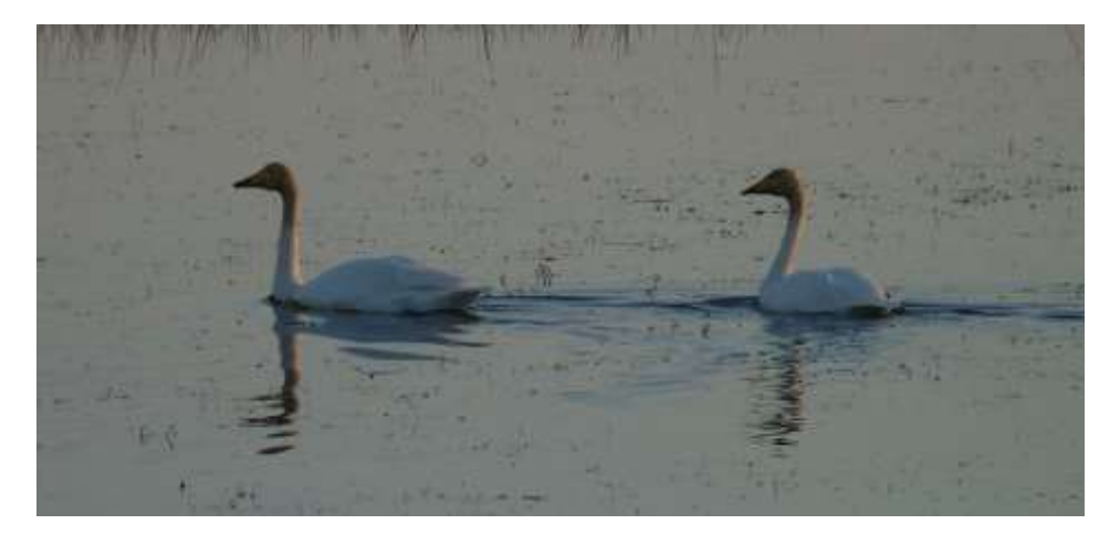
Not rare - but a surprise to see two Whooper Swans, swimming gracefully, close to the road at the Blan Loch in February