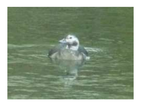
The small loch at Gorie's seldom attracts wildfowl - so this Long-tailed Duck there in late September was another real surprise.