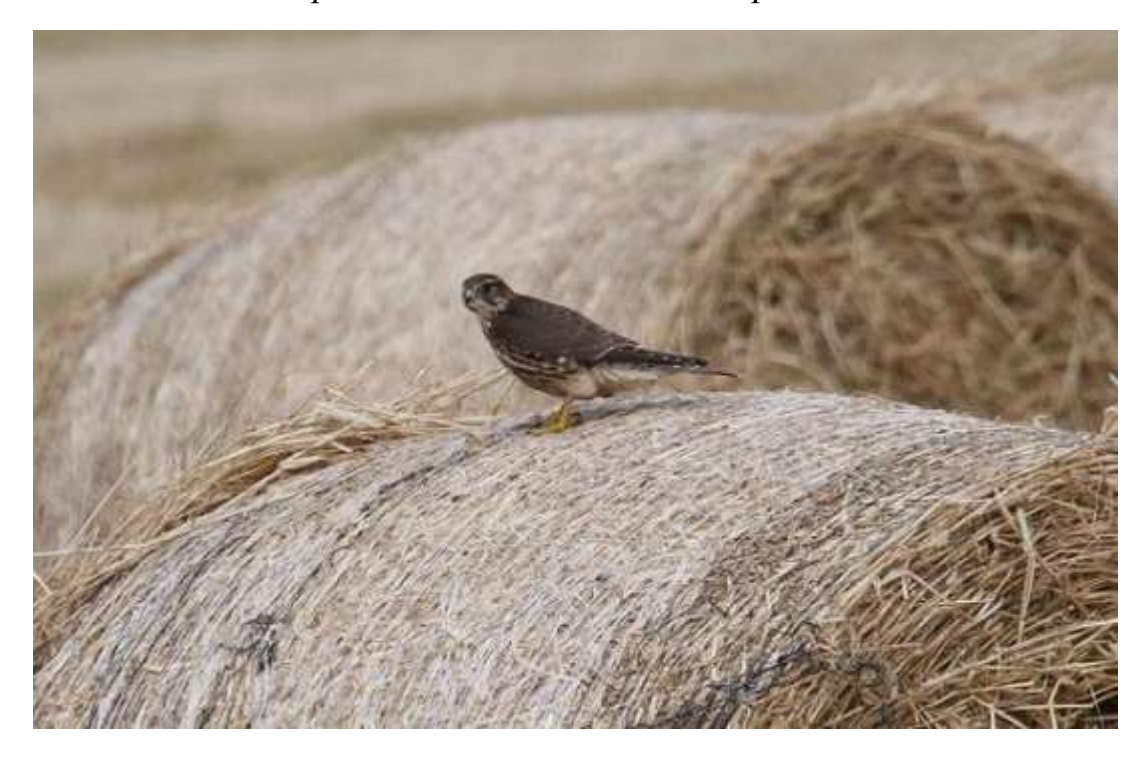
This Merlin, photographed in mid-October, was probably the same bird seen by the Minibus group the following day - the highlight of the trip!

And talking of Minibus Trips we have just heard that funding has become available and the proposed 5 minibus trips around the island will take place, beginning sometime in the new year depending on birds/weather. Look out for posters in the island shops or ring us at Castle 616363.