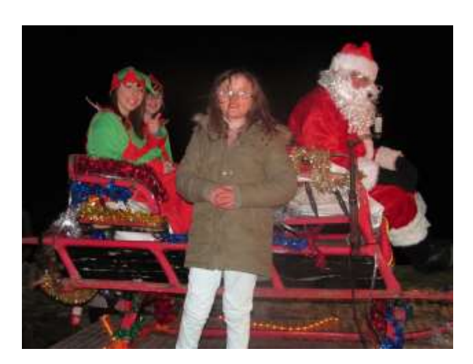
(more photographs on next page)

Up to 25 words - £1.00. 25 word advert with photo - £1.50. 25 to 50 words - £1.50 and so on. The cutoff date for adverts to be included in the next edition of the Limpet is on the front page Contact details for the Limpet are on the back page