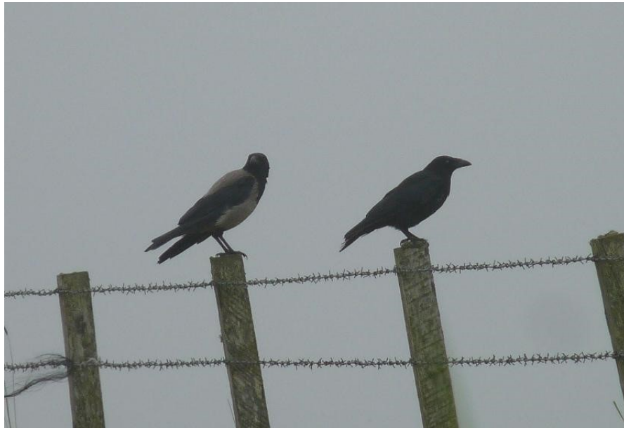
'Hooded Crow (left) and Carrion Crow near Cleat'

The most striking bird of the Autumn so far was the Wood Warbler seen by Jim at Cleat Cottage - again on 20th August - and again in strong, cold NW winds. The Wood Warbler was seen again by JH next day when SH heard - and saw - a singing Chiffchaff in the Castle garden. There is currently a big 'gathering' of crows in the Russland area - virtually all 'Hoodies' - but at least one is a Carrion Crow which posed on the adjacent fence-stab to one of the Hooded Crows as we drove past, giving us the opportunity to 'snap' the pair together. (See photo).