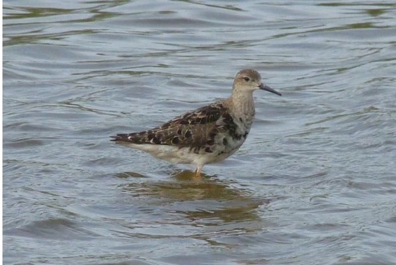
'Moulting adult male Ruff at the Bu Loch'

A nice selection of waders were seen on and off at both the Bu and Matpow Lochs in early August, including several Ruff - one a moulting male (see photo below).