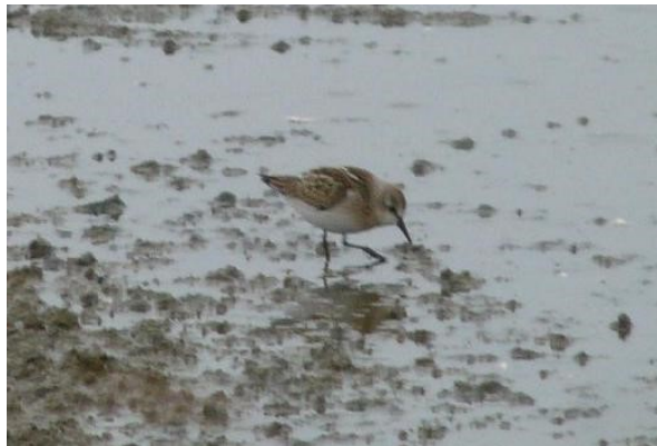
'Little Stint at Matpow - the smallest of the waders seen here'

A Pied Flycatcher spent two days in the Airy garden on 5th-6th, when two Green Sandpipers, a Common Sandpiper, several Ruff and a Little Stint (see photo below) were all present for a short time at the Matpow Loch. A Barred Warbler arrived at Cleat after easterly winds and rain on 9th but it was a week before any further migrants were found - both in the Airy garden in a cold NW wind on 16th - a Sedge Warbler and a Willow Warbler.