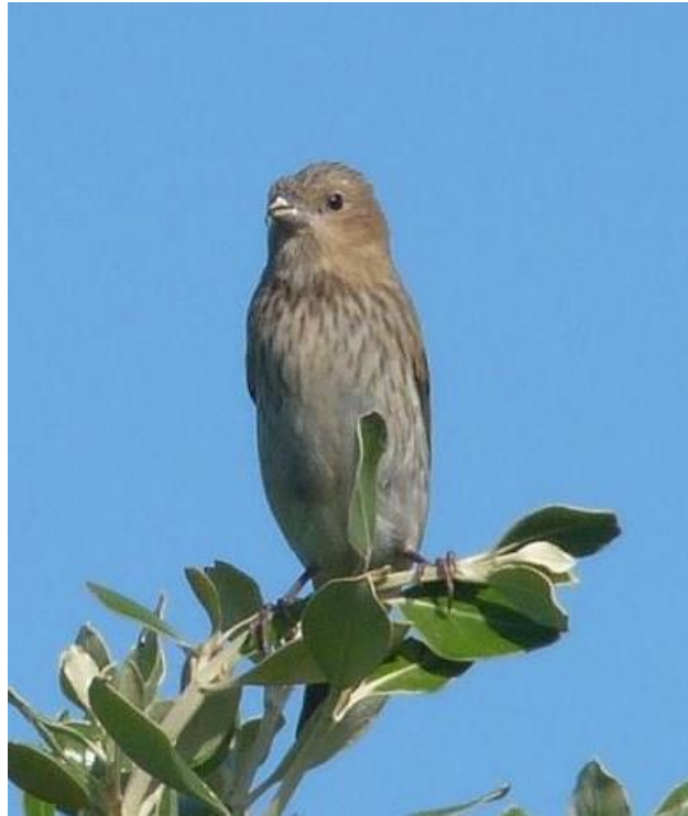
'Rosefinch in the Castle Garden - this bird was very elusive'

(Photos of Bluethroat and Red-breasted Flycatcher by George Winslow).