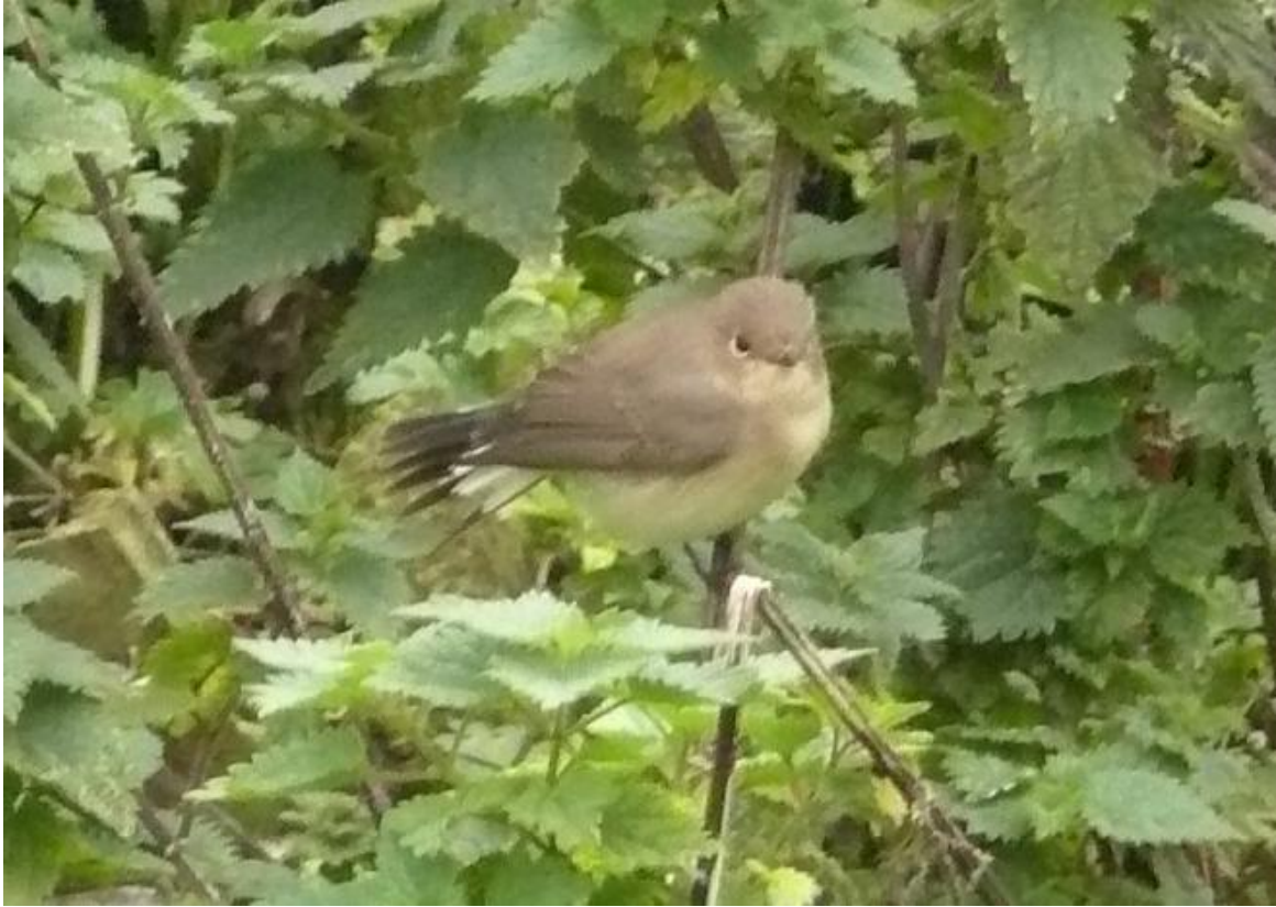
'Red-breasted Flycatcher in the Cleat Cottage garden - conveniently showing its striking tail-pattern'