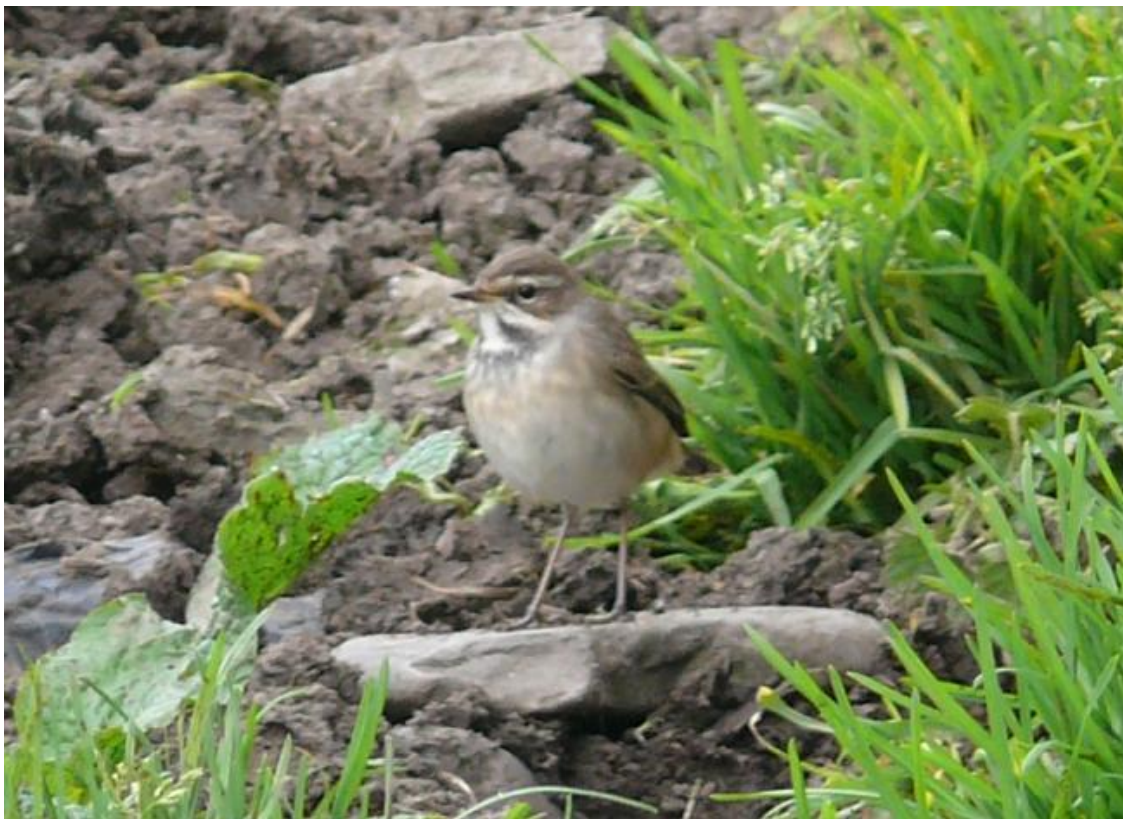
'Also elusive, this Bluethroat was seen in a muddy patch outside the garden at Odiness'