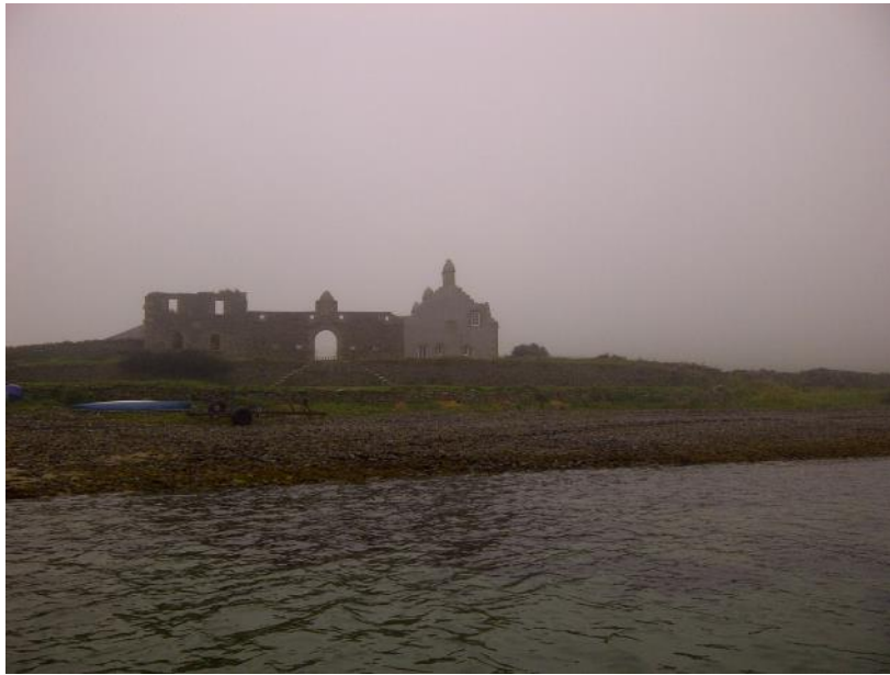
Arriving at Gairsay in the mist