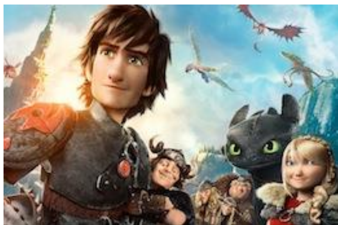
"How To Train Your Dragon 2"

Thanks again go to Stronsay Community Council, Orkney Islands Council and Pentland Ferries for their financial support.