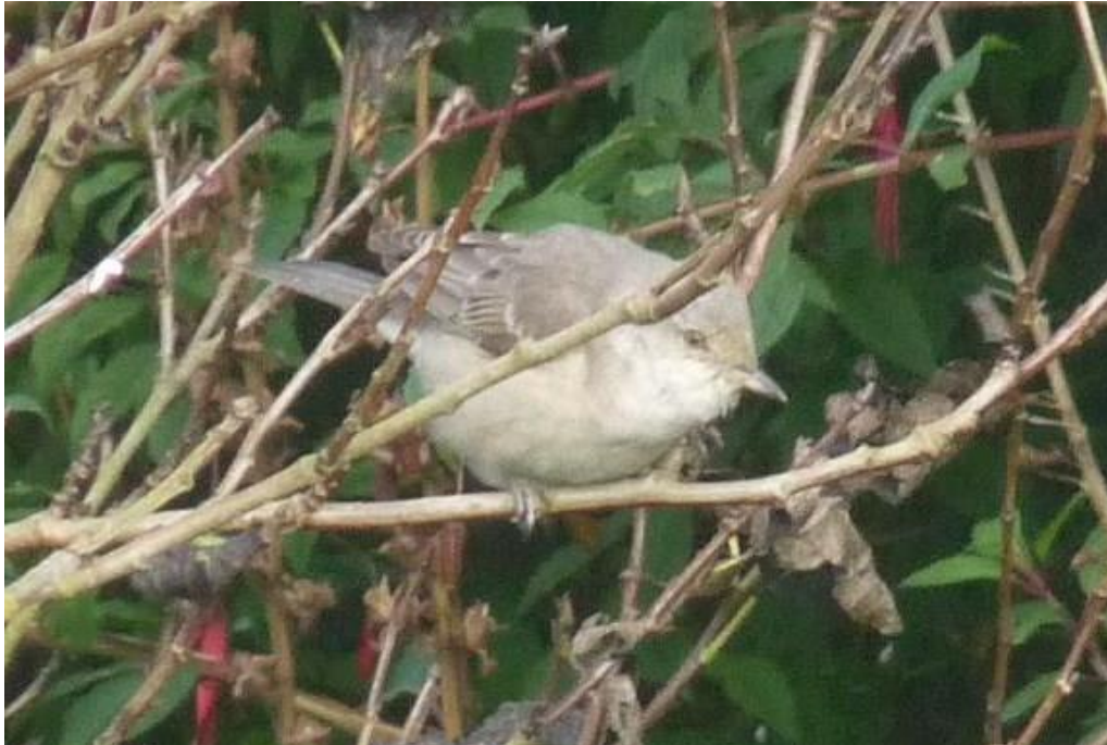
'Barred Warbler in the Castle garden - normally a rather shy species but this bird was very obliging'