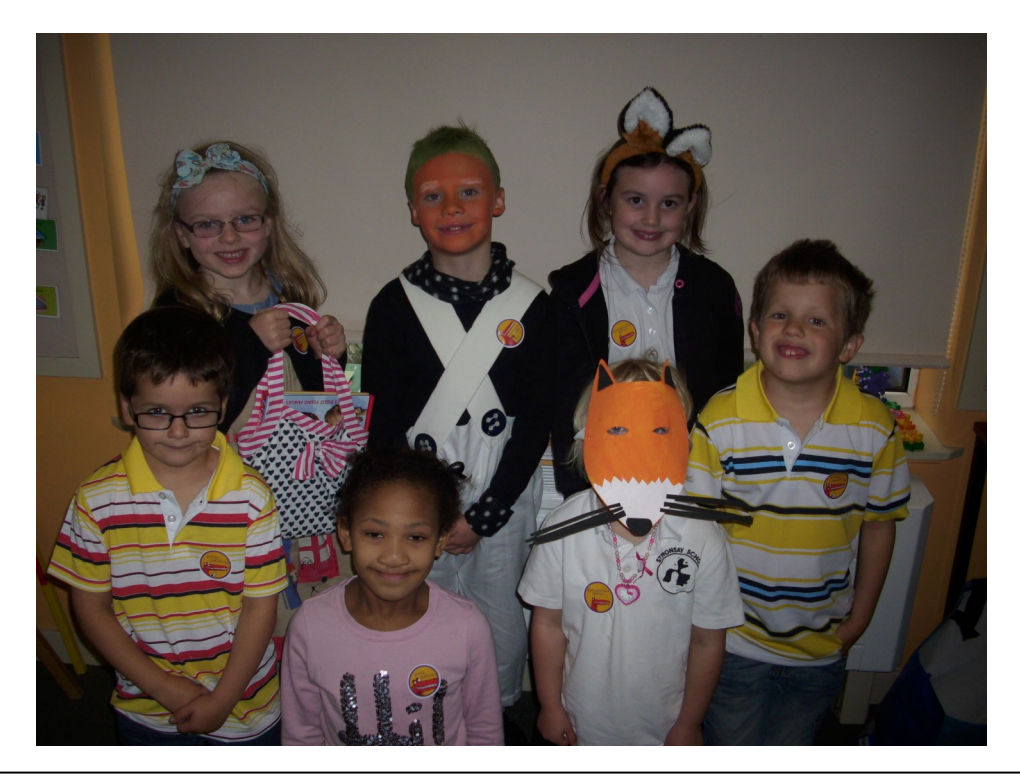
(Another photograph on next page)

Thank you to everyone for donating and dressing up!