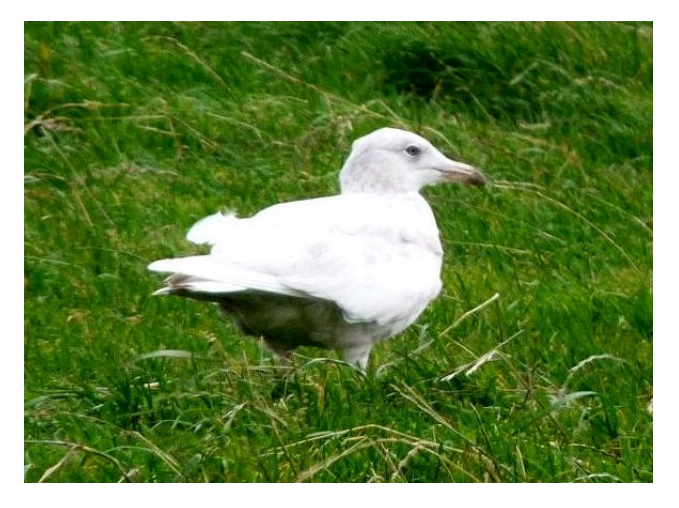
'The Glaucous Gull at Newfield. This bird was also seen nearby by Leslie Miller around the same time'

A Yellow-browed Warbler spent the day in the Castle drive and garden on 10th, when a Lesser Redpoll was seen at Holin Cottage and a record flock of Wood Pigeons for the island - 13 - were on the hydro wires near the South School. The next week was rather quiet (no winds from the east!) but there were plenty of interesting sightings: a Short-eared Owl hunting around the Meikle Water in daylight on 11th; 5 Blackcaps feeding together in the Airy farmyard; a Greenfinch at Holin Cottage (later joined by a second bird); a magnificent trio of Cattle Egret, Goshawk and Gyrfalcon on the (unlucky!!) 13th, the first Jackdaw of the year on 14th (Kath and Norman Kent saw 3 on 19th), and a Mealy Redpoll in the road by Osen on 17th.