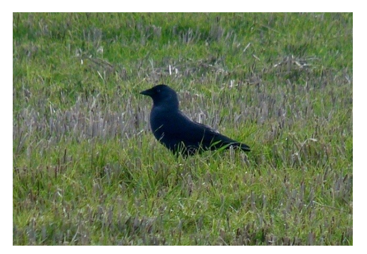
'Jackdaw at Gories – formerly a resident until the early nineties but now just an occasional visitor'

To add a touch of winter, the first Long-tailed Ducks have arrived in Mill Bay -a party of ten close inshore between Castle and Linkshouse.