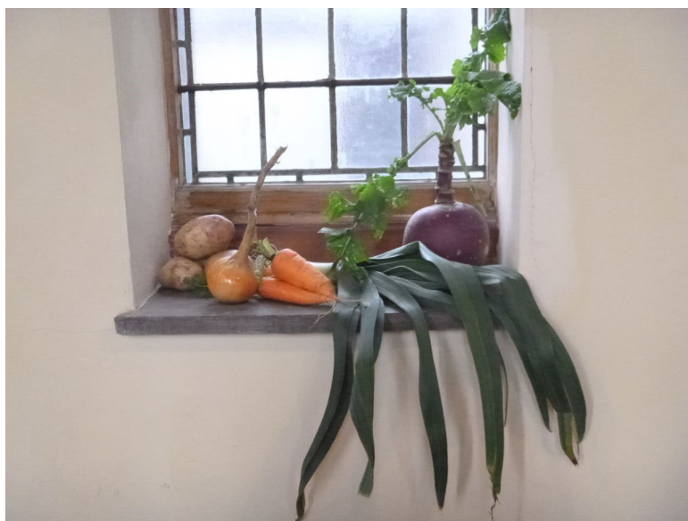
Even the window sills were decorated