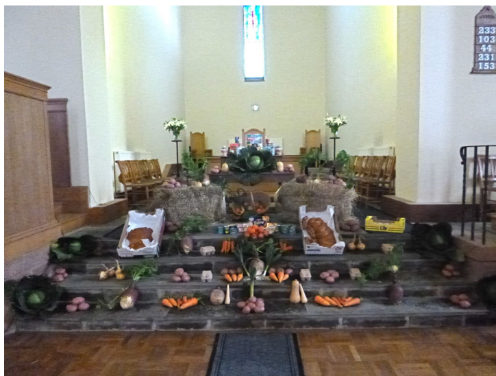
A fine display of fruit & veg plus other traditional Harvest items