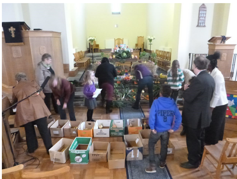
After the service all the produce was packed for distribution to elderly islanders