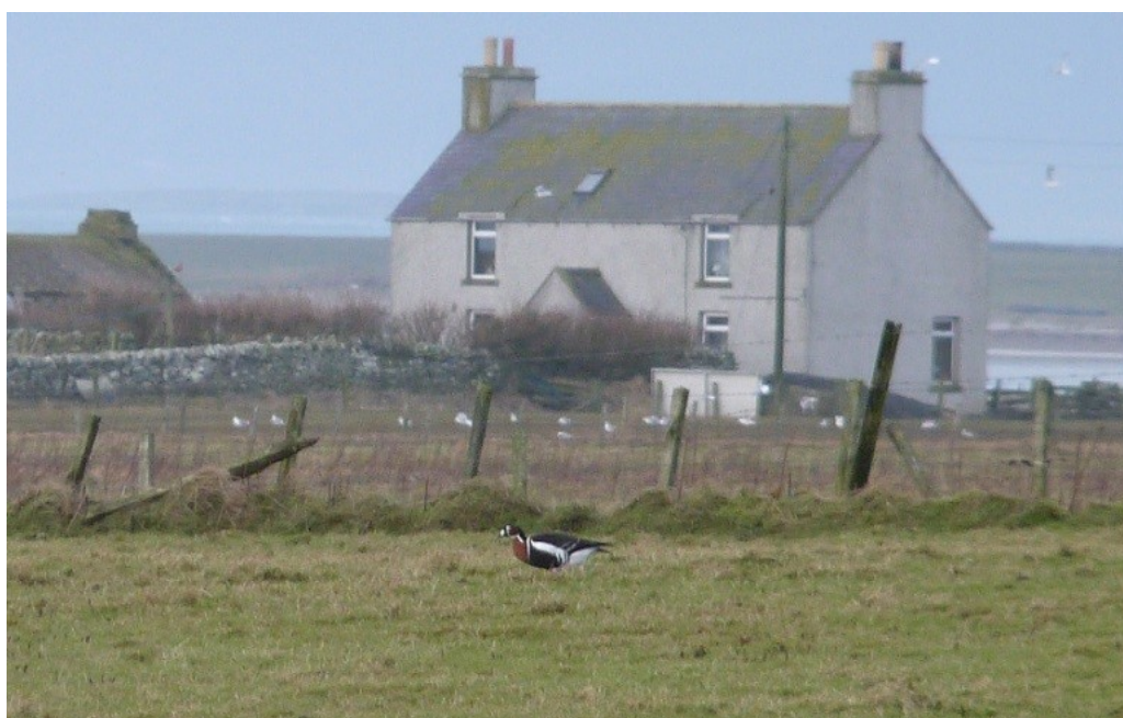
The Red-breasted Goose opposite Beechwood – the farmhouse of Fair Hill in the background