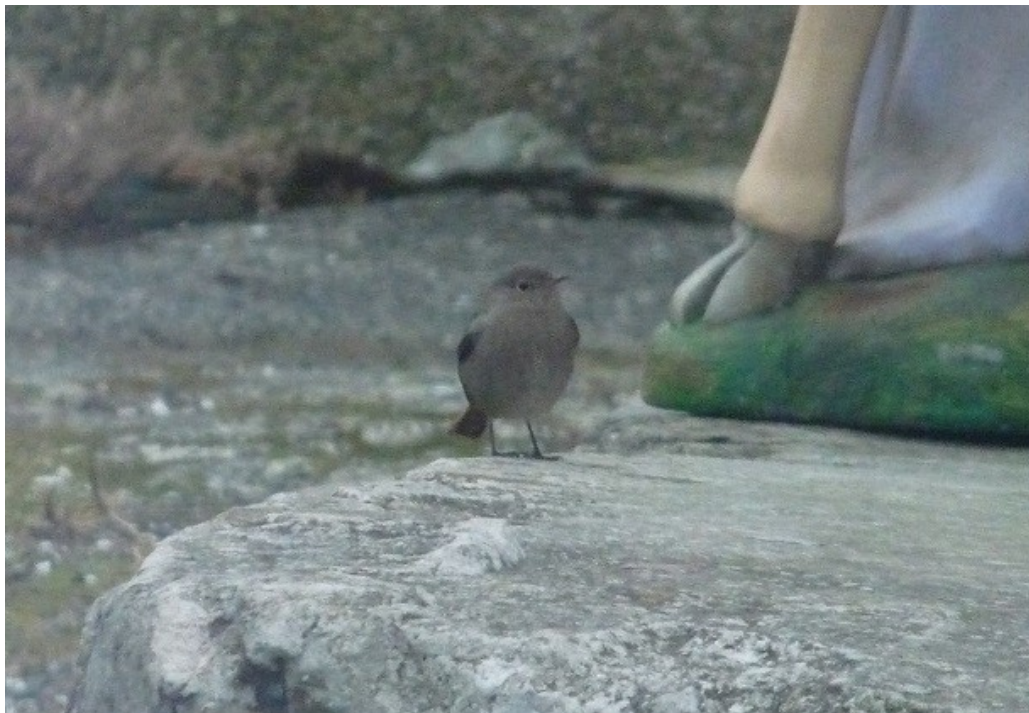
The Black Redstart beside the Monks' nativity scene in Whitehall Village