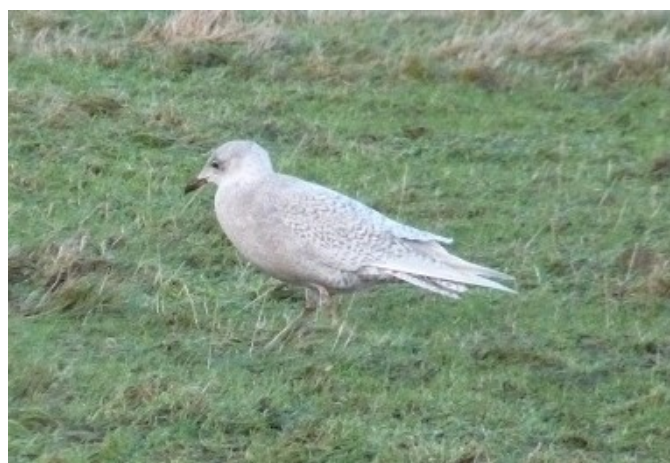
The Iceland Gull near the South School – note the protruding white wing-tips