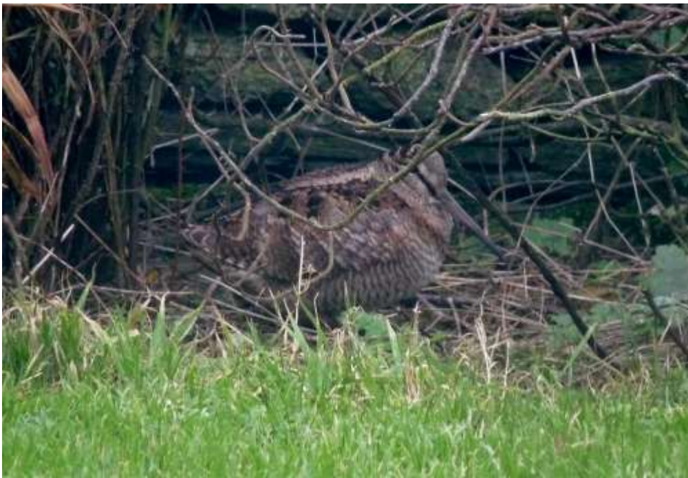
'Woodcock visit gardens occasionally in Winter. This one was photographed from the kitchen window at Airy.'