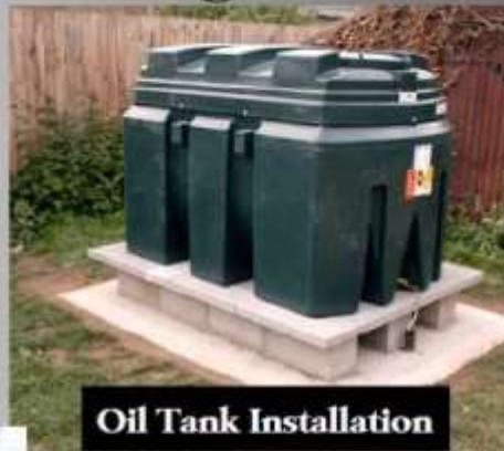
Oil Tank Installation