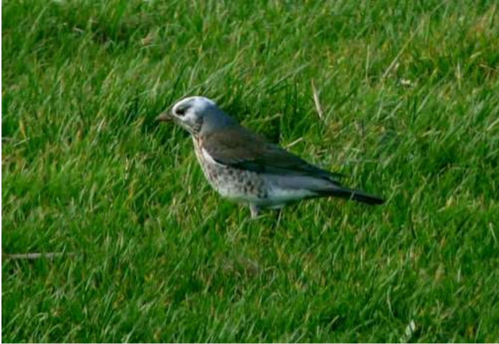
'A Fieldfare photographed some years ago. This one had a part-albino head.'