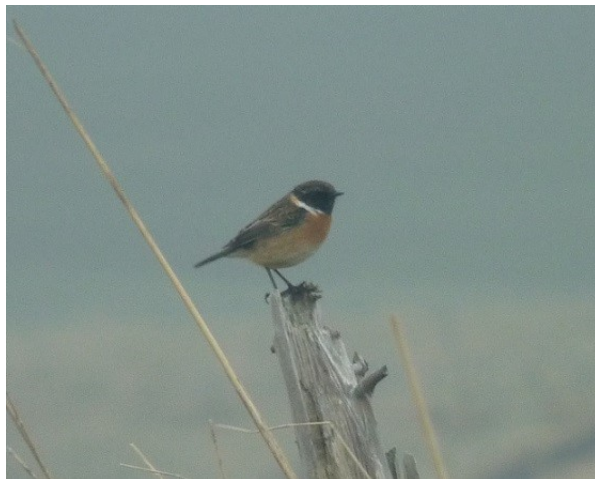
Male Stonechat by the roadside near Mt Pleasant 18th March.