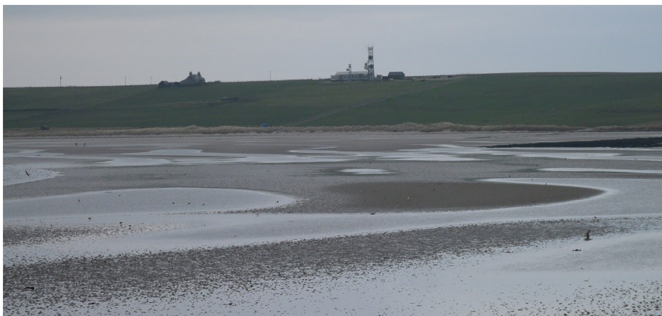
'Spoot ebb' looking North from Mount Pleasant 19th March