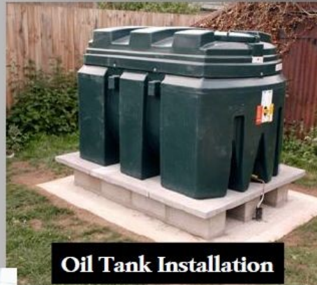
Oil Tank Installation