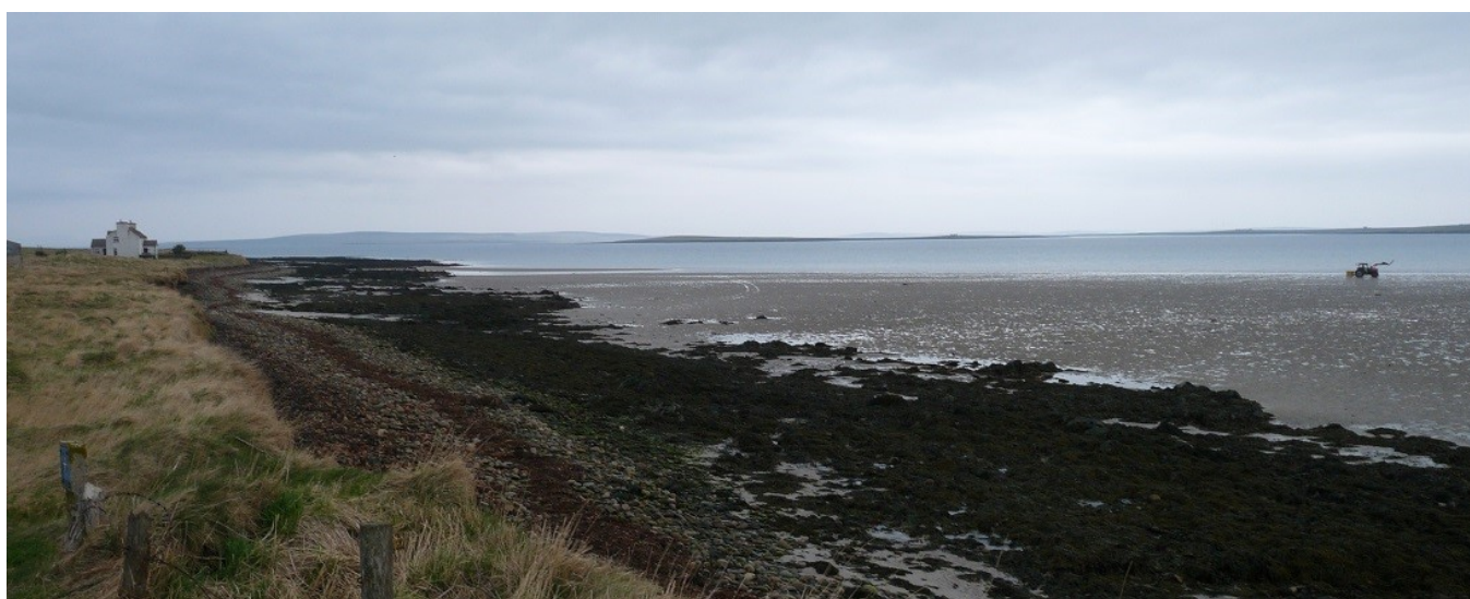
'Spoot ebb' at St Catherine's Bay looking West, 19th March.