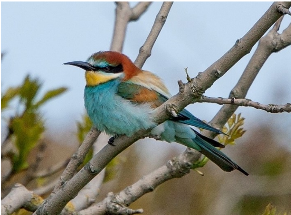
‘Bee-eater Manse garden’