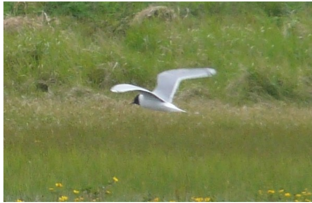
'Adult Little Gull Blan Loch'