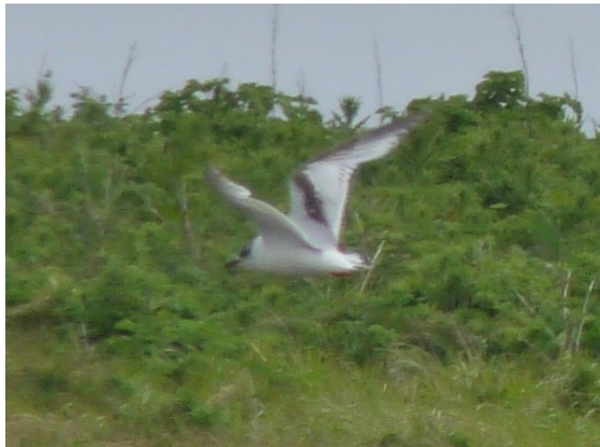
'1st summer Little Gull Blan Loch'