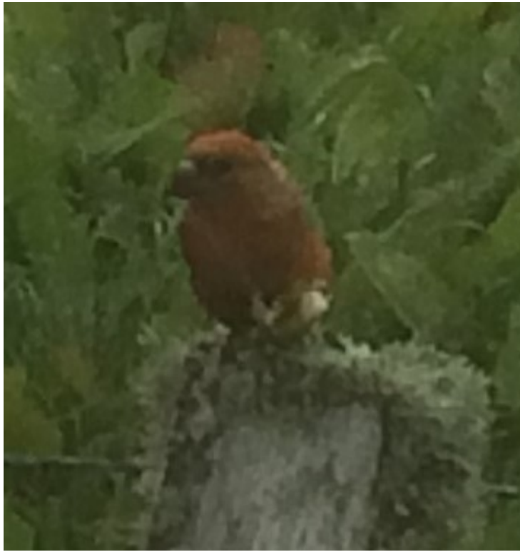
‘Male Crossbill, Holland Road – same bird as seen near Boondatoon earlier in the day’