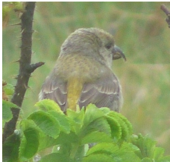
'Juvenile Crossbill, Osen 21st June. One of a party of three'