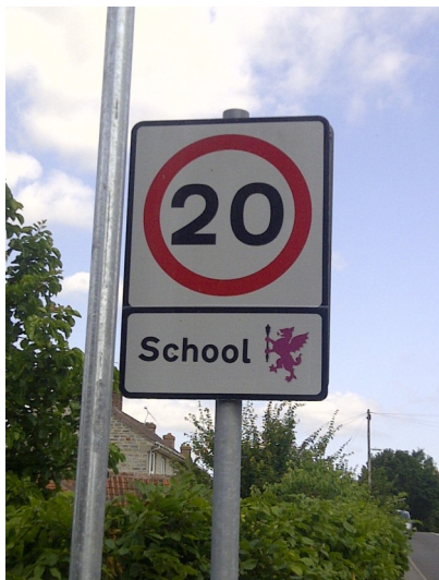
Permanent 20 mph speed limit outside an English village school

During the councillors' recess I travelled extensively through our United Kingdom and across to the continent seeing how people do things elsewhere. For example: in Lancashire rural communities have clubbed together in the "B4RN" project to bring high-speed broadband to the areas BT won't go to; in Wales and in England I saw village schools and community centres protected by permanent 20 mph speed limits; and I learnt that some small island nations impose a "tourist tax" to help compensate for the negative impact of cruise-liner visits. All ideas I am sure we could apply to the Orkney scenario. Furthermore, ferries — I crossed the English Channel for less than it costs to cross the Pentland Firth, and I discovered how low ferry fares are on the west coast of Scotland compared to ours, thanks to the Road Equivalent Tariff.