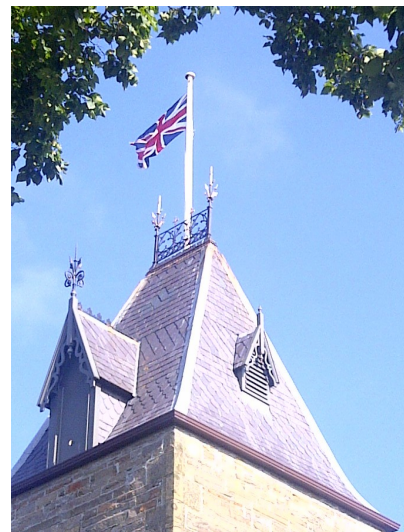
OIC celebrates Her Majesty's record-breaking reign of 23,226 days, 16 hours, 24 minutes*

In my new role as Vice-Chair of Education, Leisure & Housing (ELH), I was one of the delegates at the Islands Education Summit hosted by OIC, and reported in The Orcadian . (Did you spot the Sanday tie being worn by the Leader of Shetland Islands Council?) It was attended by the Cabinet Secretary for Education & Lifelong Learning, Angela Constance MSP, and, as well as my input into the workshops, I managed to spend time in conversation with her about the special situation of teachers in small island schools, GTC registration issues affecting applicants for teaching posts in our schools, and the particular challenges faced by life-long learners in the Isles, especially those who missed out on formal school qualifications. I believe I managed to drive the message home to members of the Scottish Government and Education Scotland that "insularity" needs to be a recognised special characteristic quite distinct from "rurality", and its peculiar problems and costs acknowledged.