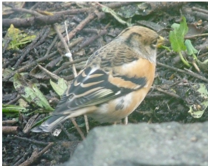
‘A male Brambling outside the kitchen window at Castle’