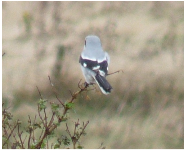
‘A rear-on shot of the Mt Pleasant bird’