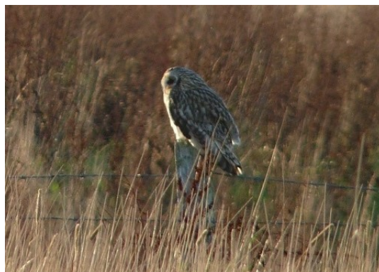
‘This Short-eared Owl was seen by several people in the Bay/Matpow area’