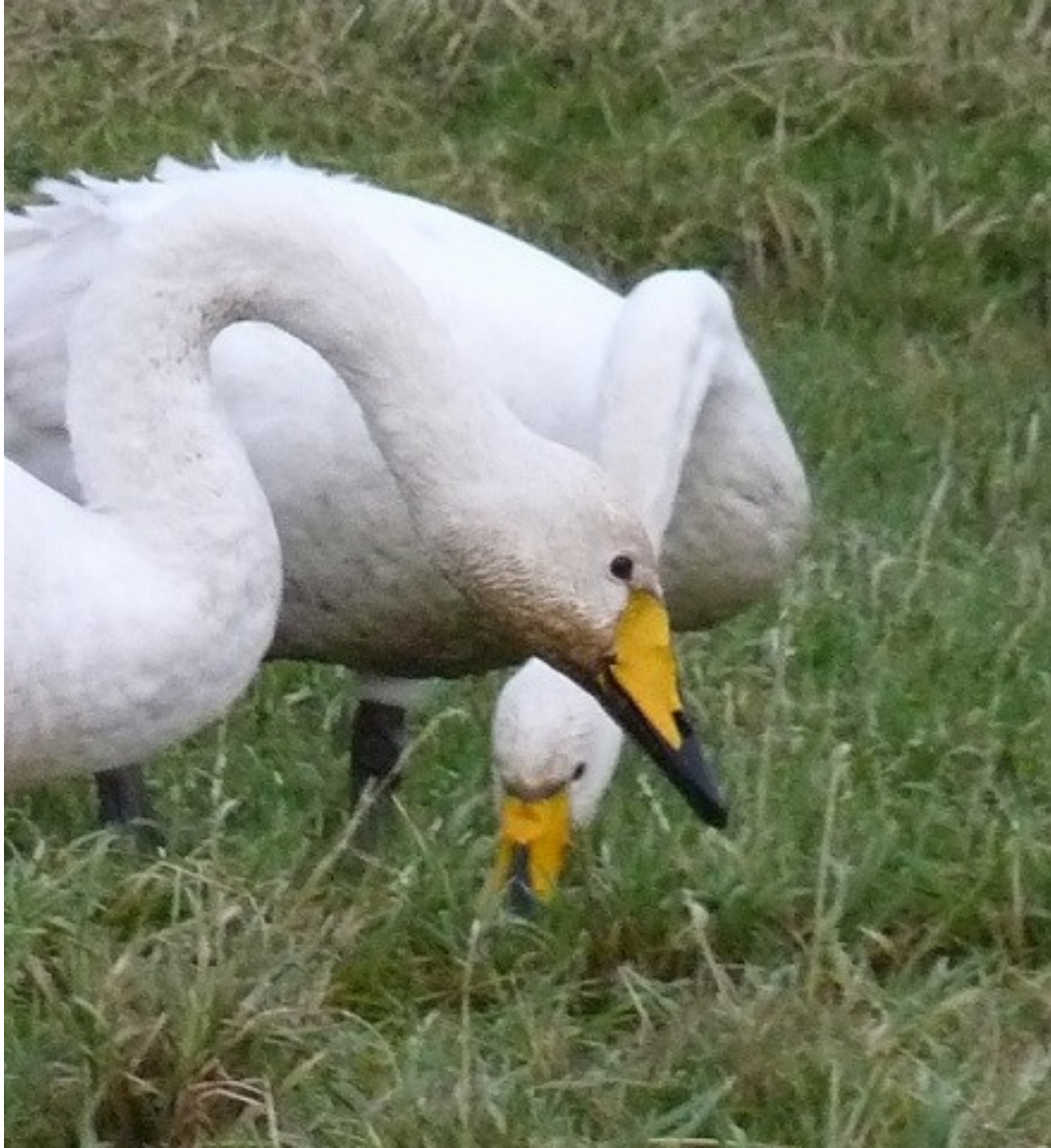
'Two of the Whooper Swans close to the Cleat road in December'