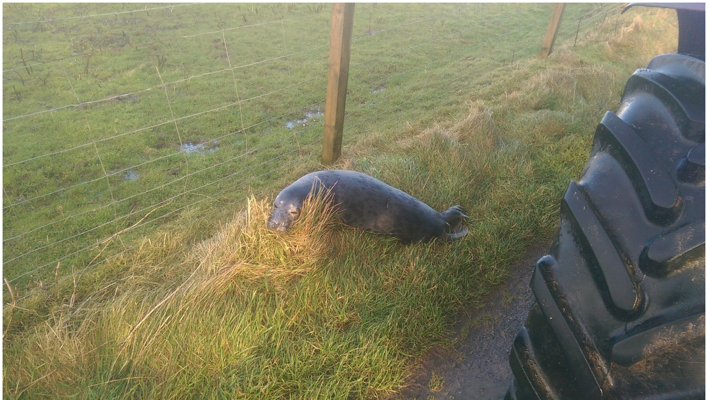
Aggressive seal near Tullimentan!