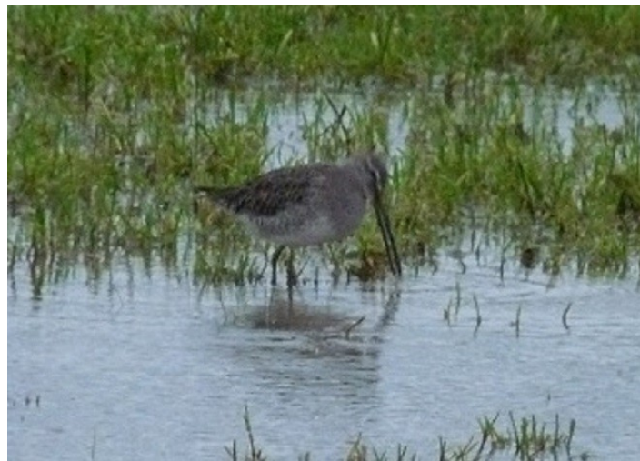
A distant shot showing the extremely long bill. (More stills from our excellent video of the bird next month)