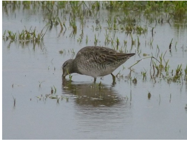
The Long-billed Dowitcher frantically feeding in the small roadside pond near Cott