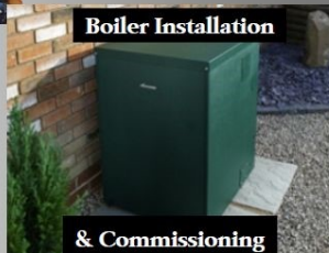
Boiler Installation & Commissioning

Oil boiler servicing, repair and replacement