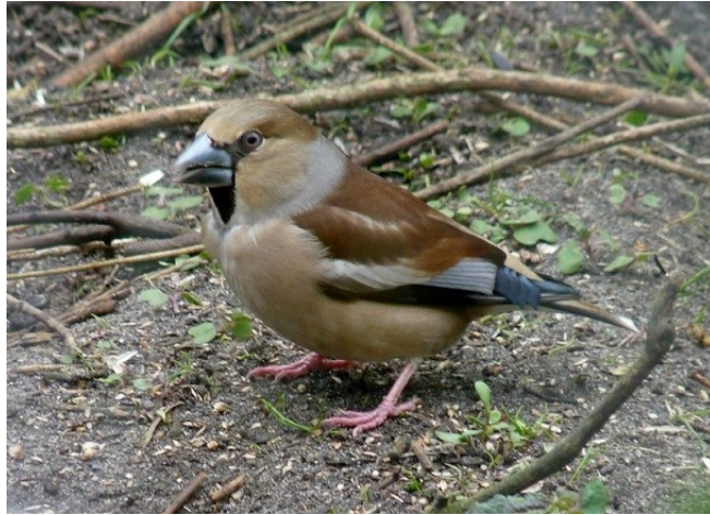
Hawfinch in the garden at 'Castle'.