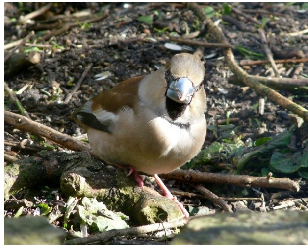
Hawfinch front-on. Look at that massive bill!