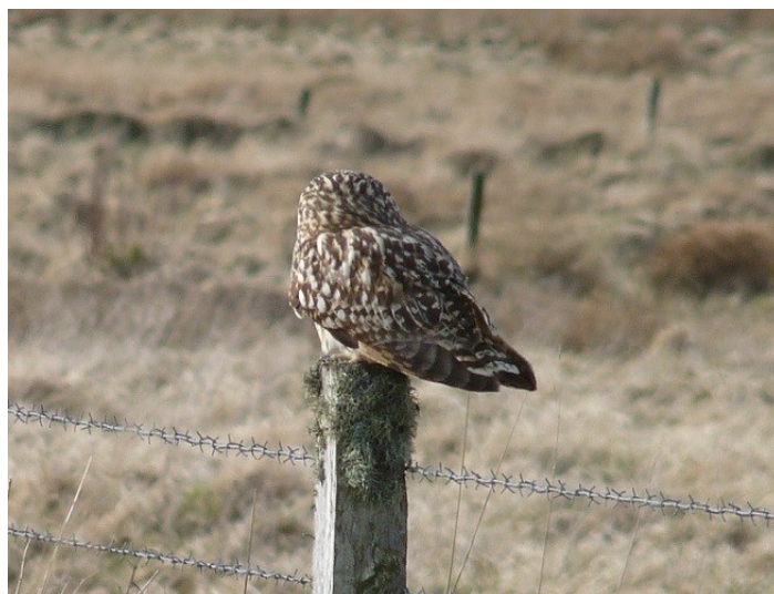
Short-eared Owl photographed from the car near Eastbank. Facing the wrong way - aren't birds just like that!