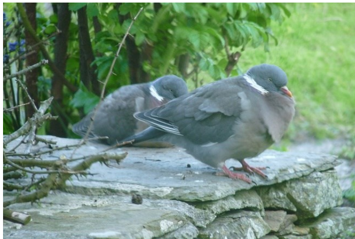
‘The two Wood Pigeons resting outside the window at Castle’

A Quail was heard calling between the South School and Eastbank on the evening of 30th and again next day. The following day, it or another bird was discovered calling by Don Peace near the Airstrip. It was still calling late morning but was not heard again.