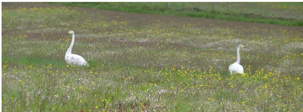
'The two adult Whooper Swans opposite the South School'

Two Whooper Swans have been seen throughout early summer in the Meikle Water/South School area, although there is no sign of nesting (see photo below).