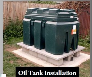
Oil Tank Installation