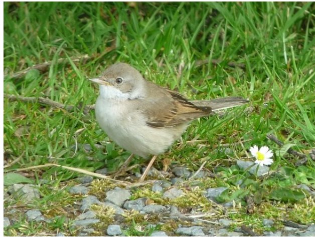
‘Common Whitethroat in the Linksquoy Drive in late May’

A very strange sighting was of two newly arrived – and clearly exhausted – Wood Pigeons in the Castle garden on the evening of 26th. They slept for two hours close to the house and then suddenly flew off never to be seen again!