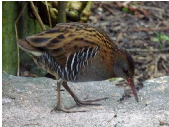
‘Water Rail in the Castle garden – one has been seen on and off in the garden at Gesty Dishes this Winter’