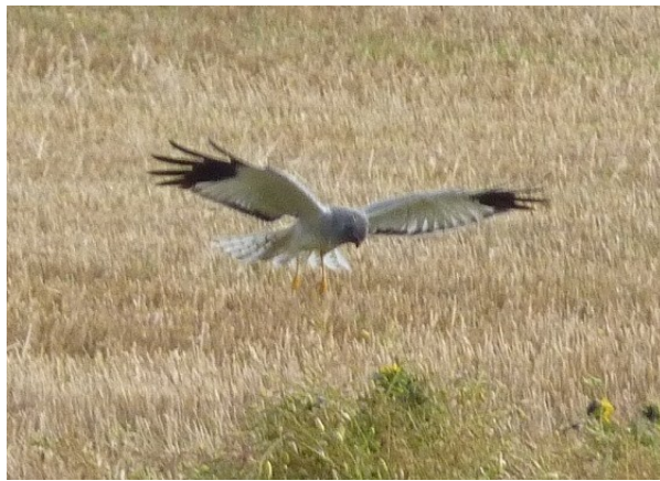
‘An adult male Hen Harrier at Dale. ’.