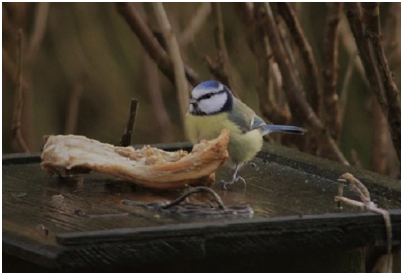
‘The Blue Tit at Helmsley – positively ‘feasting it!’