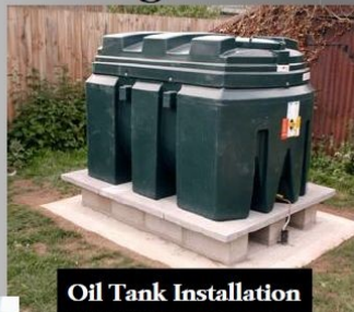
Oil Tank Installation