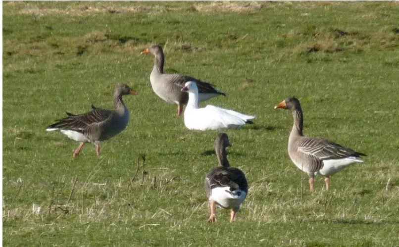
‘The Snow Goose – still present until at least 9th February’