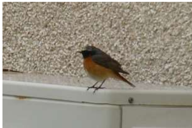
'Redstart on the heat pump at 'Islesview' (JH)