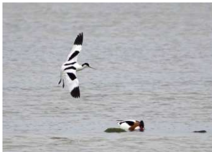
‘Avocet and Shelduck Bu Loch ’