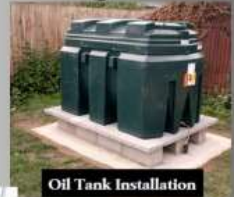
Oil Tank Installation