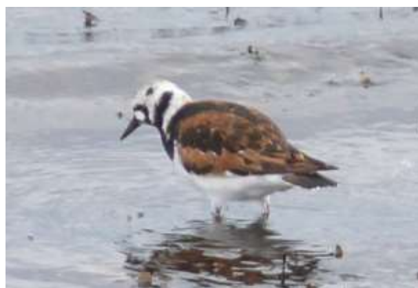
'Turnstone in full breeding plumage below 'Mt Pleasant' (JH)