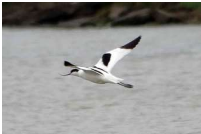
‘The Avocet over the Bu Loch ’