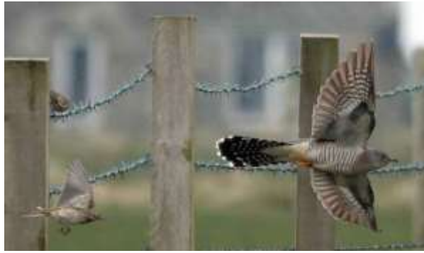
'Cuckoo being 'mobbed' by Meadow Pipits near 'Cliffdale'