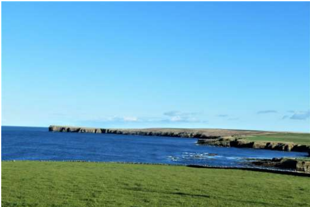
Odiness Bay and Burgh Head

Soon after, the wind picked up and, with a heavy swell also now setting in, a dangerous cross sea became apparent so they decided to head for home with all haste. No sooner had this decision been taken than one particularly large sea came over the side of the dinghy, half filling it with water, and seconds later another wave turned their little craft completely over, throwing all four occupants into the sea. None of the four could swim but luckily the two men managed to keep a hold of the hull of the boat as it turned over. Tragically they could do nothing to aid the two young boys who had been swept away from the dinghy and out of their reach and were both lost.