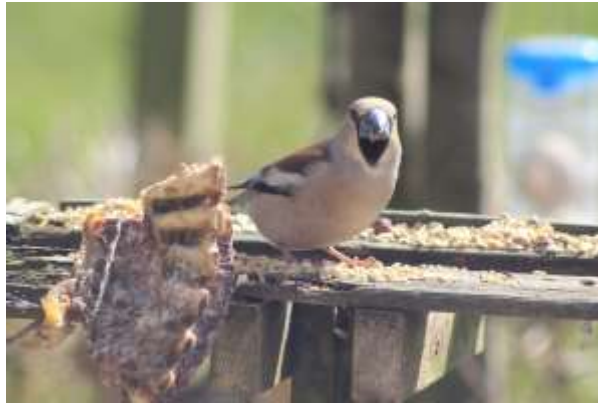
'Hawfinch at the bird table, 'Helmsley' (S Burger)