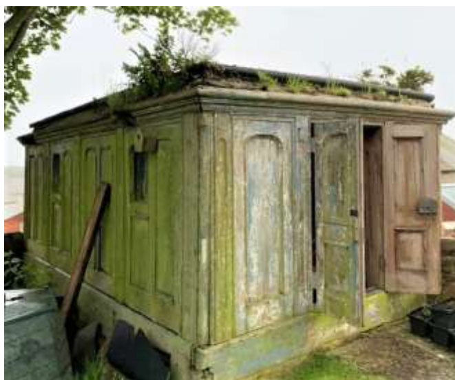
Part of the deck house (the 'Smoking Room') off the Saint Rognvald (continued on next page)