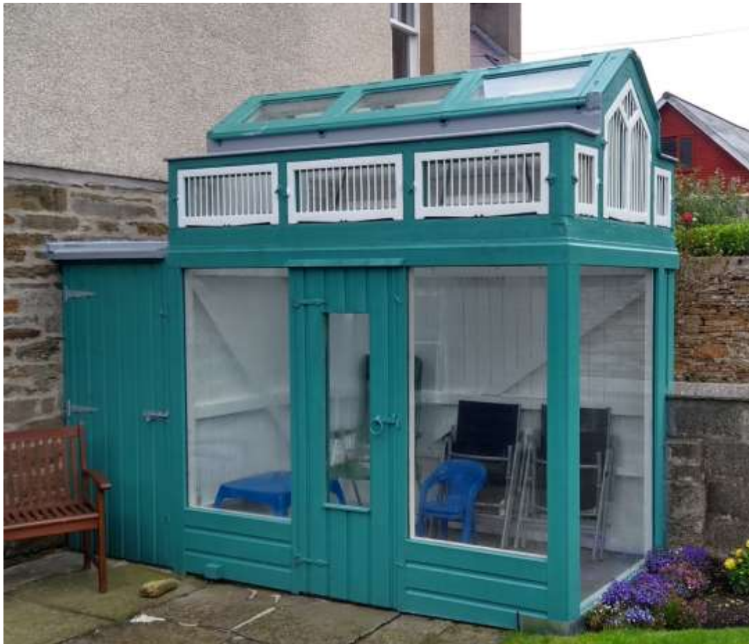
A beautiful little summerhouse made out of part of the deck house of the St Rognvald

Another, and possibly the last, visible reminder of the St Rognvald is a charming little summer house in another Kirkwall garden, this time in Willow Road, and I was delighted to be allowed to take some photos and to hear a little of its history from the owner.