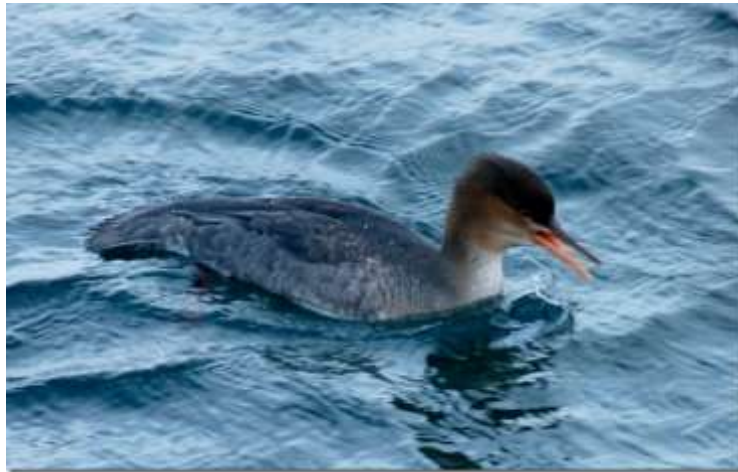
Female Red-breasted Merganser between the piers. Regularly seen in Whitehall Village during winter.