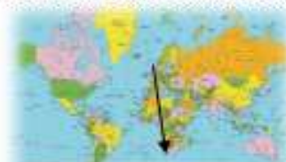
Stronsay to Cape Town via Flamborough, East Ayton, Ashby-de-la-Zouch, Flamborough (again), East Ayton (again), York and London Heathrow Airport (plus Driffield, Scarborough, Bridlington and Burton Fleming in between!)