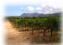
Table Mountain from Groot Constantia

The last ten days have been uneventful to say the least. We have been stuck in a hotel room, overlooking the swimming pool, with views of the 2,195ft Lion's Head mountain. We were most concerned about the regular occurrence of terrifying explosions and wondered if the city was under siege, until we realised that the explosions happened at the same time every day. Google informed us that the Noon Gun has been fired on Signal Hill almost every day since 1806. Now, we listen out for it as it signals to us that we are another 24 hours nearer to our release date. However, we have been adequately entertained by the Fawlty Towers style room service whilst incapacitated; in fact, it has become the highlight of our day. It doesn't matter what we order, it is a complete lottery as to what is actually served.