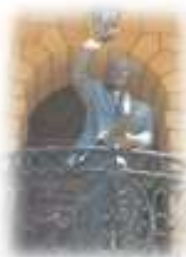
Statue of Nelson Mandela at the Town Hall, where he gave his first public speech following his release from prison