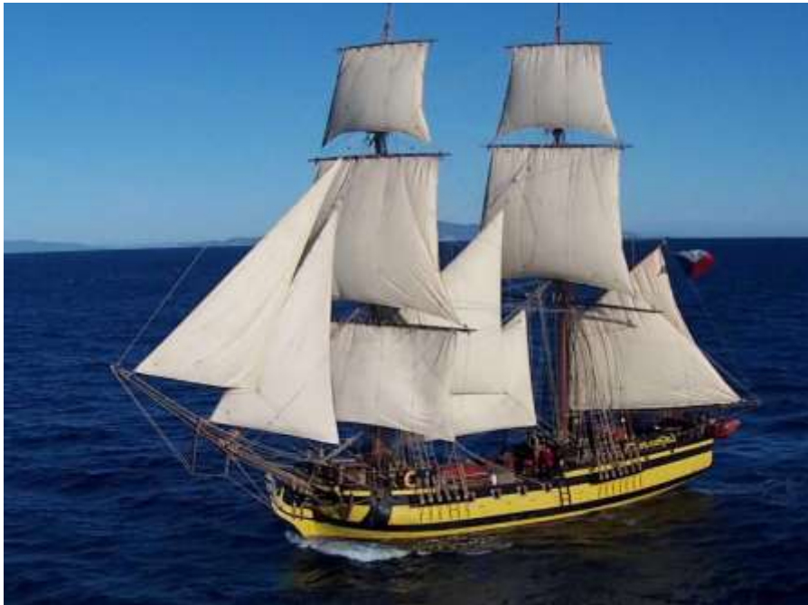
The 'Revenge' would have been something similar to this ship.

After taking over the ship and being appointed her captain, Gow and the Revenge spent some time sailing along the coast of North Africa and Spain, often being within sight of the coast there, looking for ships to plunder. Their first prize was a small sloop, the Delight, bound from Newfoundland to Cadiz with a cargo of fish. With little worth taking, the Revenge topped up her stores from the vessel and then sent her to the bottom. Nine days later, Gow captured a Scottish ship, the Sarah, only to find it too was carrying a cargo of fish, this time bound for Genoa.