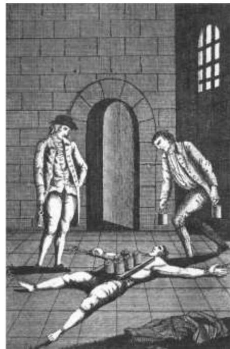
The ‘art’ of pressing a confession!

The second part of this story will be in next month’s ‘Limpet’