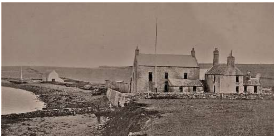
Carrick House in Eday, on the shores of Calfsound