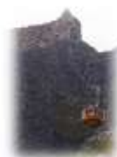
Cable car descending Table Mountain

Prior to our 10 days of quarantine, we visited some of Cape Town's most famous landmarks: we took a cable car up Table Mountain; we drank wine at the Groot Constantia vineyard; we soaked up the sun at Camp's Bay; we shopped 'til we dropped at the V & A Waterfront and Canal Walk; we ate in many different restaurants at half the price we would have paid in the UK; we walked in the footsteps of Nelson Mandela and controversial former president Jacob Zuma at Robben Island prison.