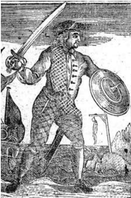
A depiction of John Gow

On 26 th May, the trial of Gow and his shipmates began but was delayed by Gow’s refusal to plead. After the application of thumbscrews, then being ‘pressed’ (stretched out on the floor and heavy weight placed on his body) for several days, Gow unsurprisingly agreed to plead guilty to his crimes of piracy! He and nine of his shipmates were quickly convicted and sentenced to hang.