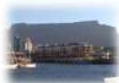
V & A Waterfront

Cape Town is as exciting and vibrant as any capital city, made more so by the feeling of real and tangible racial integration. This is evident in the food, the shops, the interaction of its people and the overall feeling of equality and inclusion whatever the colour of your skin or your creed. In many respects, it feels more respectful and inclusive than our own capital city. We only spent a week out and about before required to quarantine, so no doubt there is an element of 'rose tinted spectacles' about our experiences, but nevertheless, our first impressions were very positive.