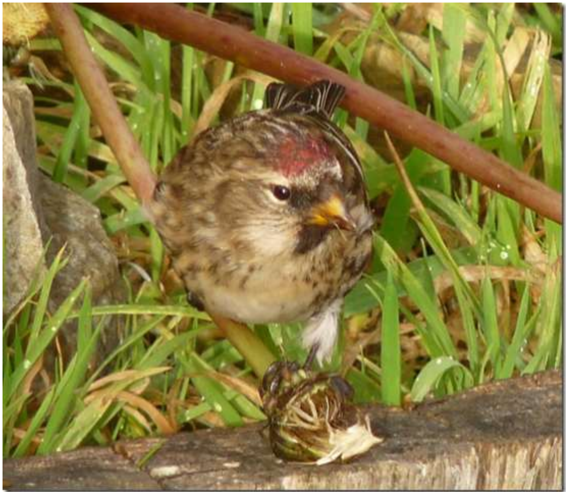
A Brambling and a Redpoll – both photographed in the tiny garden at Park Cottage in late Autumn.