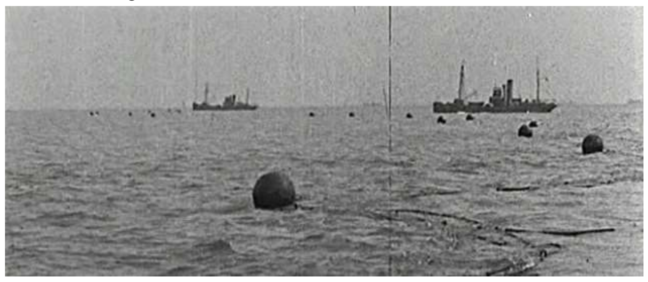
A great number of steam drifters were requisitioned by the Admiralty to be engaged with handling the boom nets designed to stop enemy submarines entering the harbour.