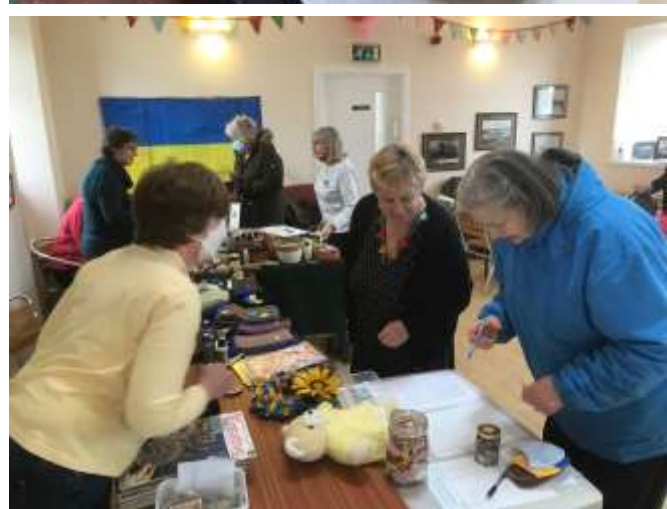
Page 6 of <u>The Stronsay Limpet</u> - Issue 201—March 2022