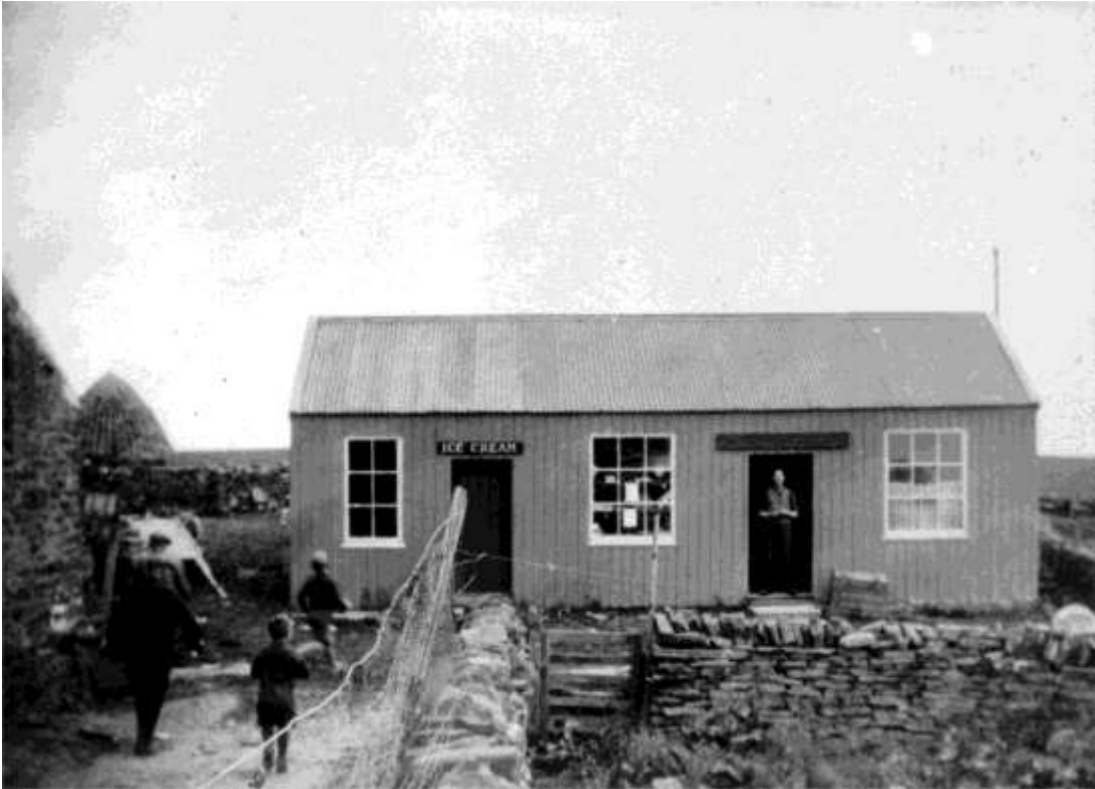
The shop and the ice cream parlour on Papa Stronsay, open annually to cater for the influx of workers to Papay during the herring fishing.

There was a small but well stocked shop on Papa Stronsay, selling fresh bread taken across from the Stronsay bakers every day and, amazingly, also a small ice-cream parlour which was open during the herring fishing season. Blocks of ice were imported from Kirkwall twice a week to provide the refrigeration and Papa Stronsay milk used for the production of the ice cream sold in the parlour.