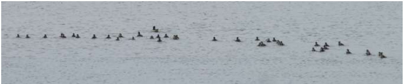
‘A ‘creche’ of Shelduck at the Bu Loch in evening light – July’