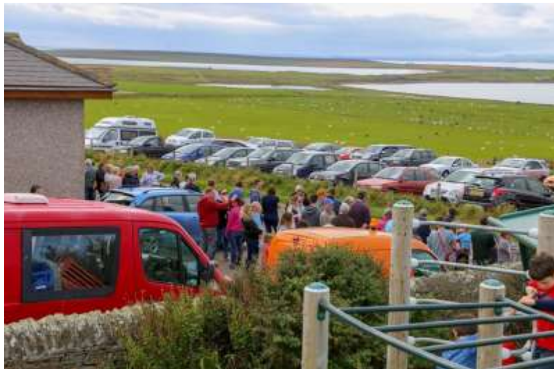
Stronsay's Massive Weekend 2018