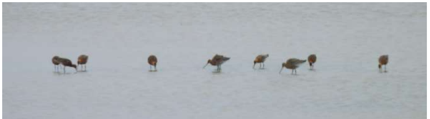
‘Adult Black-tailed Godwit – also at the Bu Loch – July’