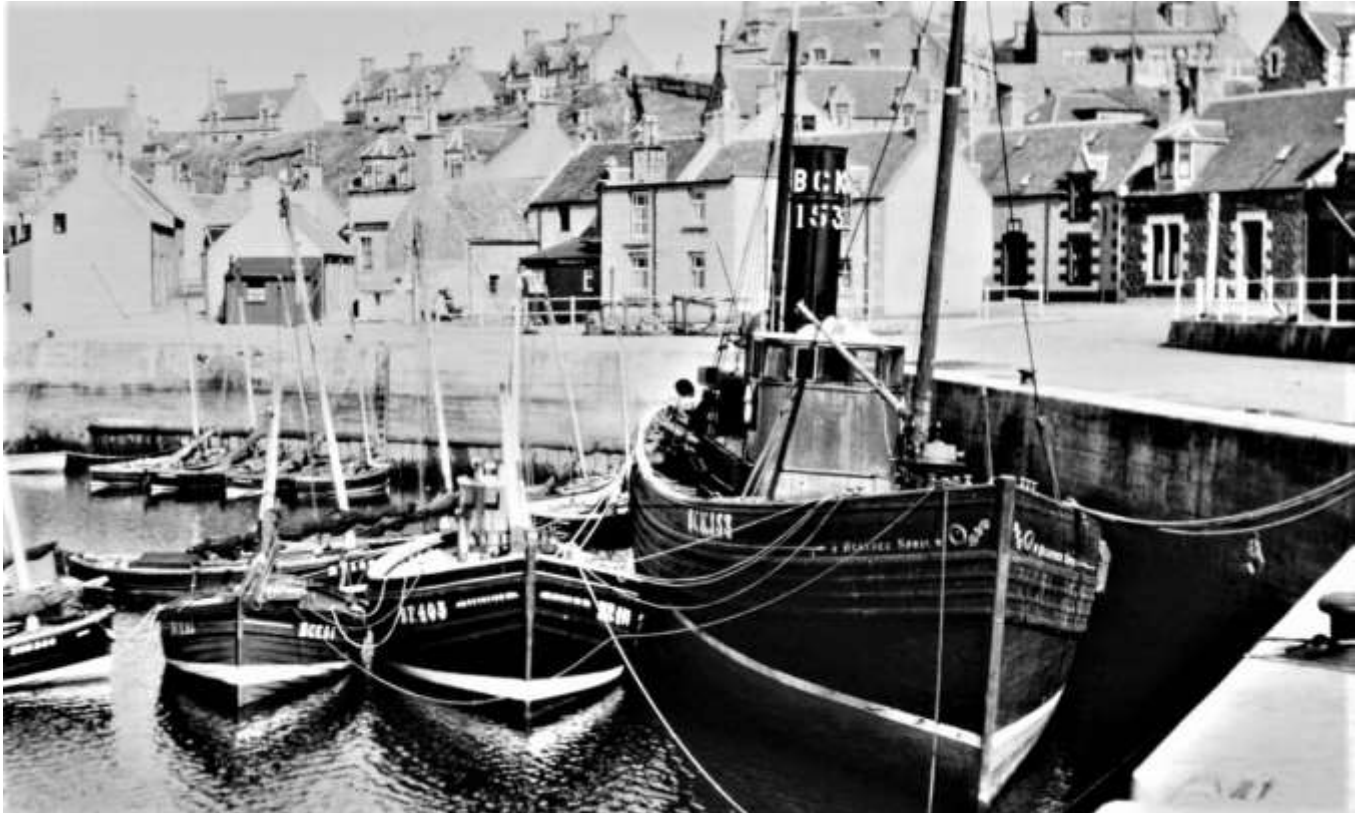
The Buckie registered steam drifter 'Heather Sprig', one of the three drifters stranded on Ingale, shown here moored in Findochty Harbour.

"We were going so fast." said the teller of the tale, "that I thought we might run on over the skerry on a dry keel and into the sea again on the other side. But we didn't, we stuck hard for'ard with a nasty grating sound. Astern we were all right, propeller was still racing. Well, we tried to get off of course, wondering all the time what would happen if we did. We had felt such a "dunt" that we thought our bottom must be a mass of iron filings. We got out a kedge anchor, but it didn't do us much good.