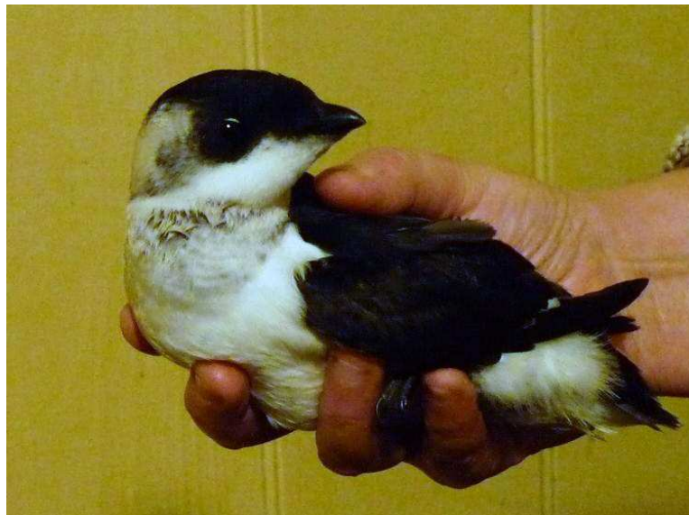
The Little Auk at Castle