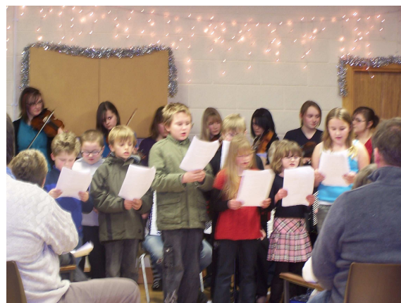
School children singing