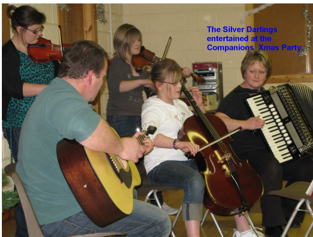
The Silver Darlings entertained at the Companions Xmas Party.