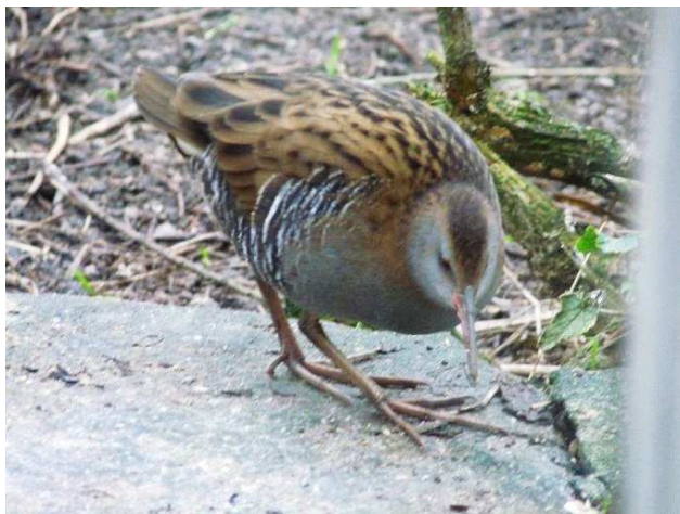
The long-staying Water Rail in the Castle garden - feeding outside the kitchen window

And still – as yet – no Glaucous or Iceland Gulls! A very different mid-Winter period.