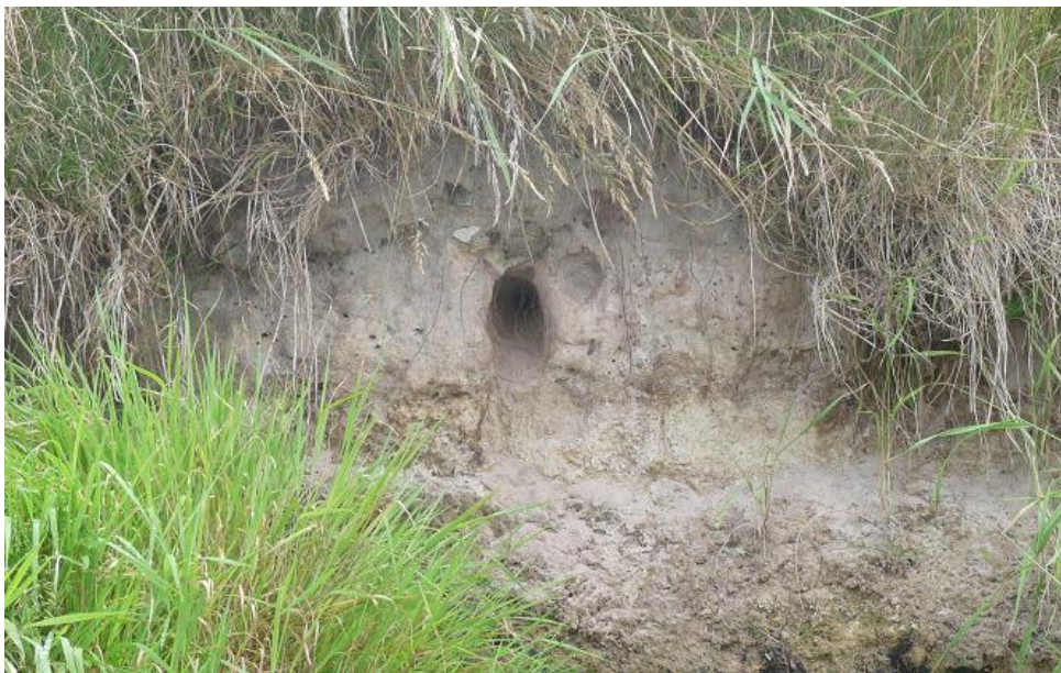
The Sand Martin's nest in the cliff-face alongside The Reserve - 50 yds from the site where the species nested in 2007.

The brood of Sand Martins emerged from their tunnel nest along the Mill Bay coastline on 26th June - several days before the Swallows nesting in our nearby old pig-styes emerged. There appeared to be four young of each species, the family groups often being seen catching insects in and around the Castle garden. Mid-summer is generally quiet as regards uncommon species, so a real surprise for Sue & I at 9.25pm by the Fire Station on 4th was a Hobby, dashing off towards the Meikle Water - probably for an evening meal. The species is crepuscular (active around dusk) and generally feeds on large insects such as Dragonflies, but in northern latitudes resorts to catching small birds in flight, usually 'hirundines' - including Swallows and Sand Martins! Our sighting was somewhat tinged with concern for our own hirundines which regularly feed on small insects above the Meikle Water.