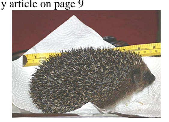
'Hotchi' 5 weeks later; 720 grms, nearly 9" long

The next edition of The Limpet will be published on <u>Thu 25 Nov</u>. Items for inclusion in that edition should be submitted by <u>Sat 20 Nov</u>. Contact details on back page