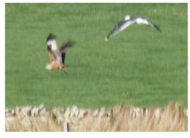
Red Kite & Great Black-backed Gull