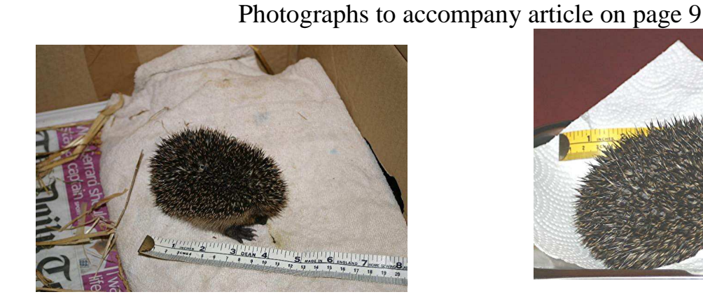
5 weeks ago; 120 grms, 4" long. 'Hotchi' warming-up on his hot-water bottle

Each month just over 200 copies of the Limpet are printed and distributed; about 55 copies are sent to postal subscribers and the rest go to householders on Stronsay via the local shops. The cost of printing and distributing the Limpet is just over £2,000 per year and is subsidised by the Stronsay Development Trust. Individual colour photographs are particularly expensive to reproduce so from now on you'll find all the colour photographs together on pages 1 and 2 with links to the articles that can be found later in the document. One "green" idea to reduce costs is to make the Limpet available as a document (in PDF format) on the internet. If you would be happy to forego your printed copy and view the Limpet on the web please contact Bruce Fletcher at ricardian@btinternet.com