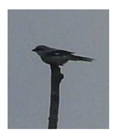
Great Grey Shrike