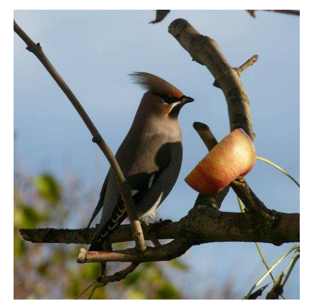
Waxwing at Lower Millfield