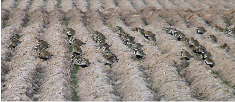
Part of the huge Golden Plover flock near Boondatoon in mid-April