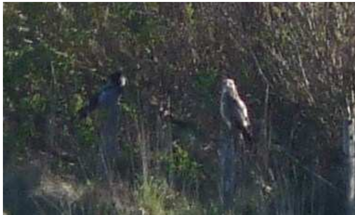
The Rough-legged Buzzard near Millfield on 16th, a Hooded Crow on the next fence-stab