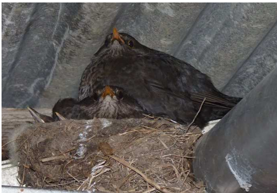
Two female Blackbirds on the same nest - the bills of two of the chicks can be seen protruding to the left.(NK)