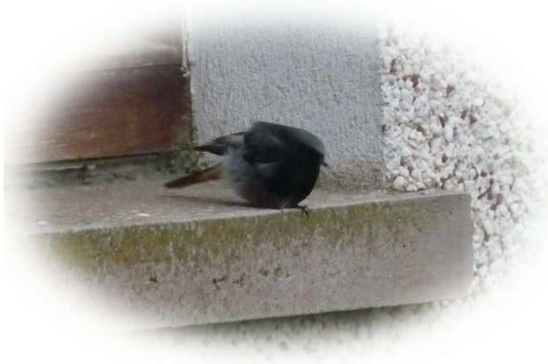
Male Black Redstart on the window-sill at Seafield. (JH)