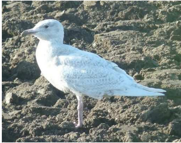
The 2nd year Iceland Gull following the plough at Dale in late April.(JH)