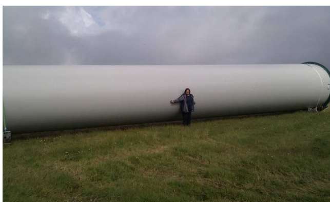
This one has our name on it!