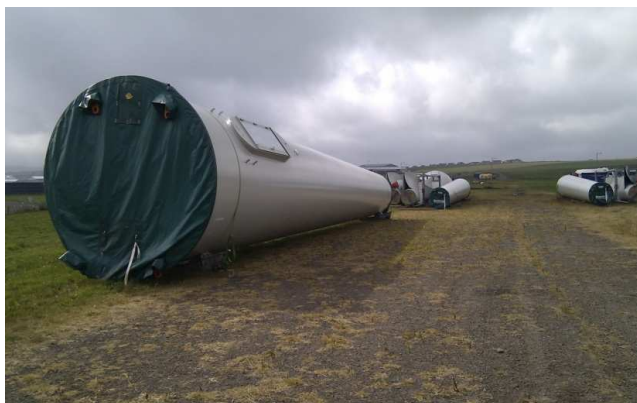
Turbine at Hatston, Kirkwall waiting for delivery to Stronsay.