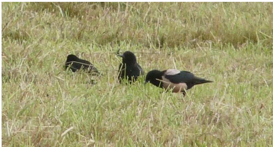
Rosy Starling with two common Starlings at Breck on 22nd July (concluded on next page)

A few waders are now beginning to appear on the Bu Loch in particular, including several Black-tailed Godwits, Knot and Dunlin, and a few Whimbrel have joined the Curlew in the newly-cut silage fields. Swallows have had a tremendous breeding season so far and this appears to be the case over the whole country. Three pairs have nested on The Reserve this year. Sand Martins too have been successful, with pairs in Mill Bay and another in Rothiesholm.