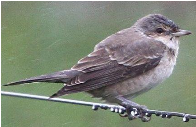
Barred Warbler, The Pow (Hayden Holloway)