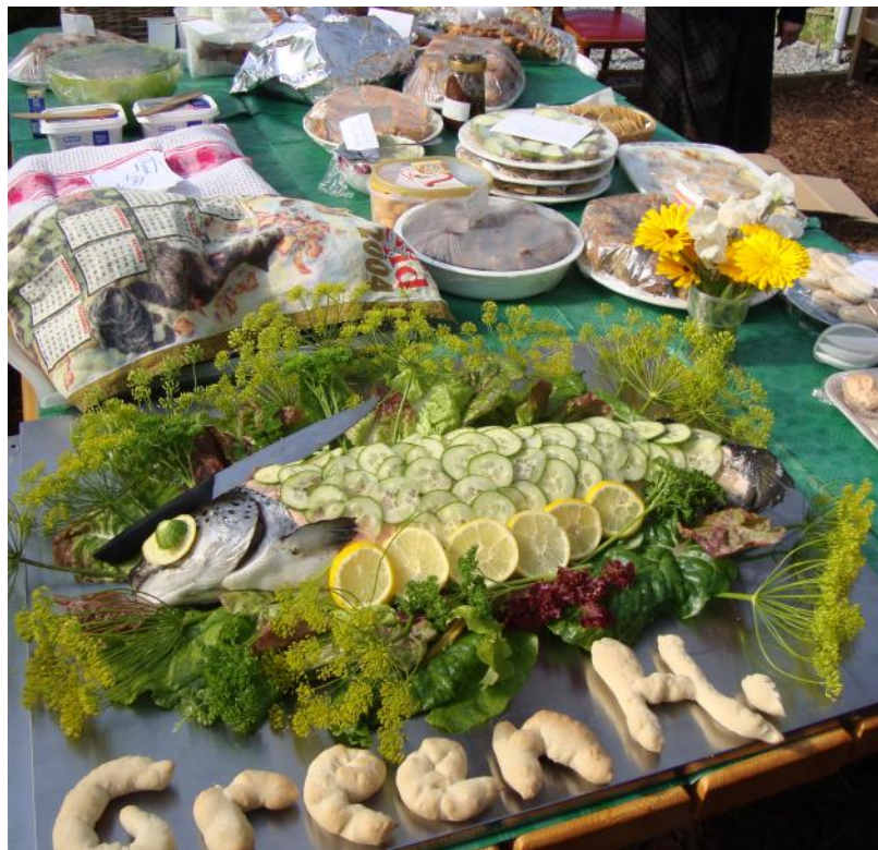
What a mouth-watering selection of food!