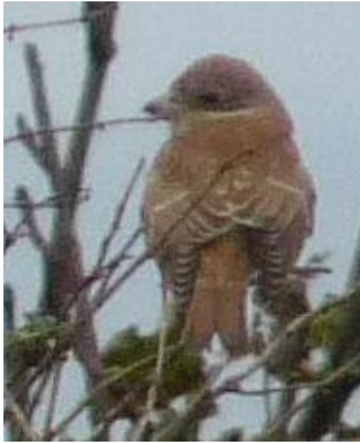
Red-backed Shrike, Airey