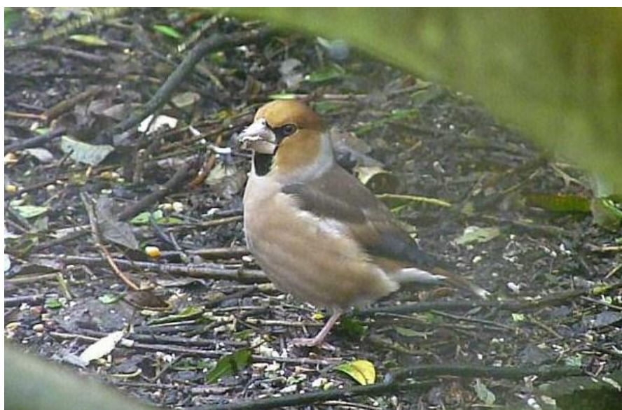
Hawfinch outside the Castle kitchen window (Big bill!)