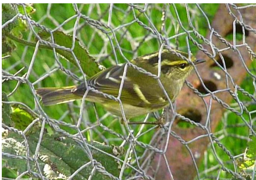
Pallas's Warbler at Cleat Cottage (Green and yellow bird)