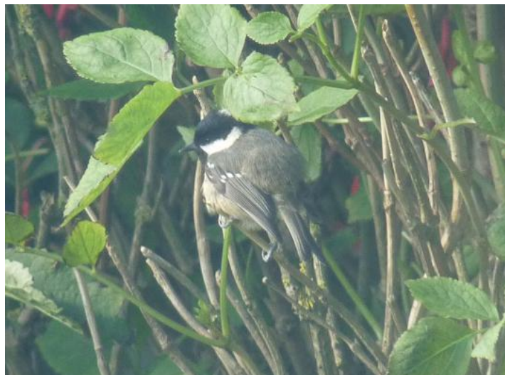
Coal Tit in the Airy garden (Black and white bird)