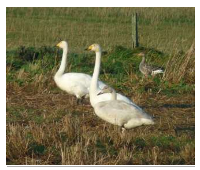
Three Whooper Swans near the South School