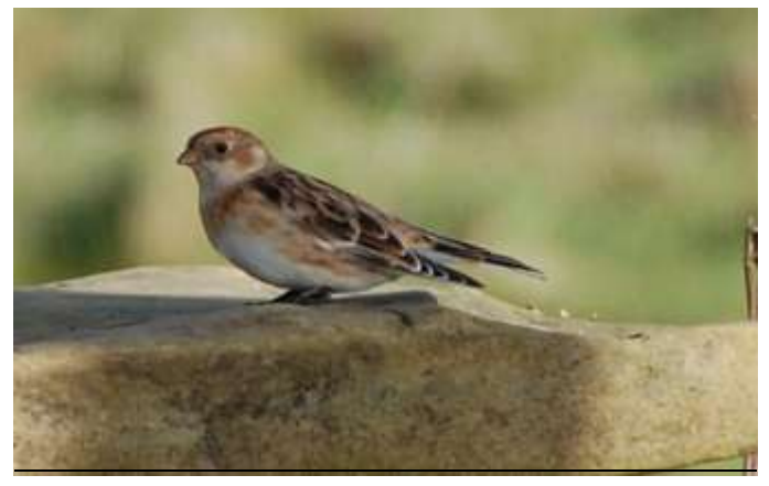
Snow Bunting This individual photographed on the stone dyke at Cliffdale in late Autumn