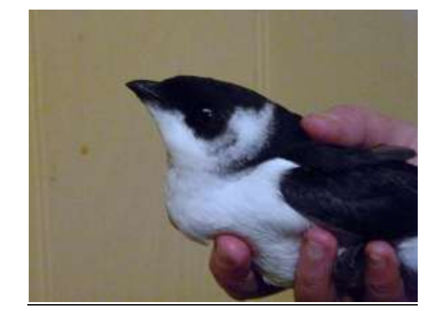
Little Auk This one was safely returned to the sea some years ago