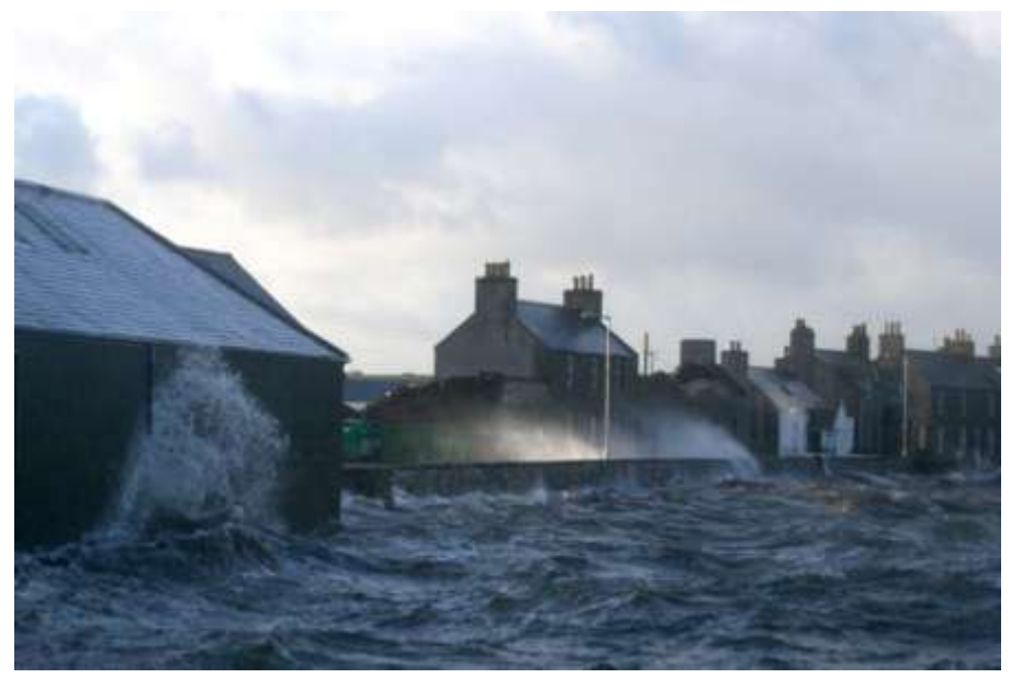
Page 15 of The Stronsay Limpet - Issue 78 December 2011