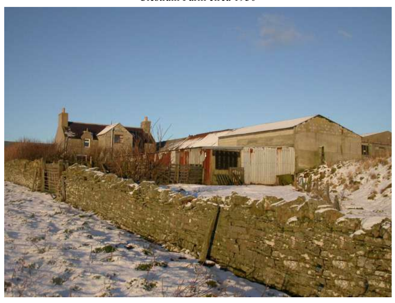
Clestrain Farm 2005