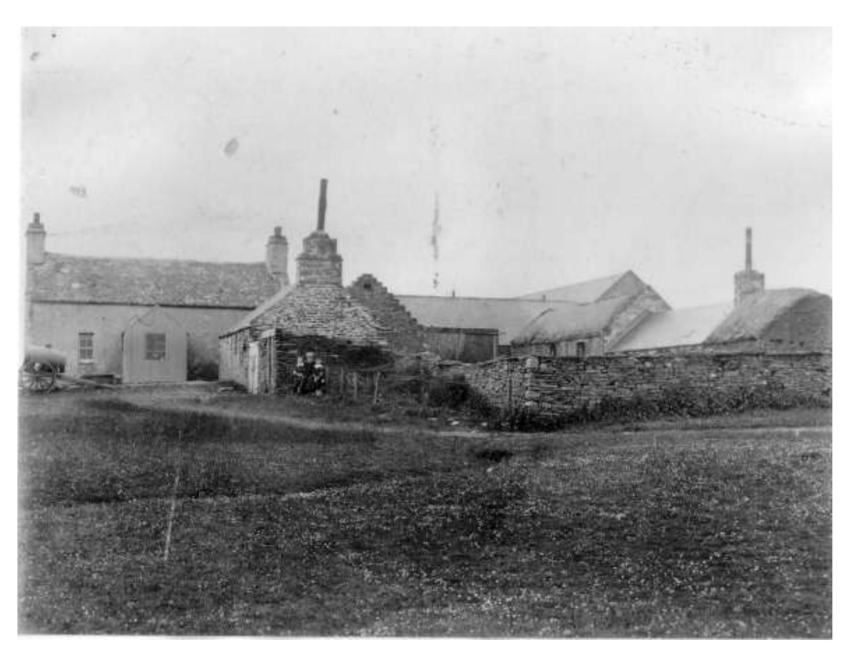
Clestrain Farm circa 1930