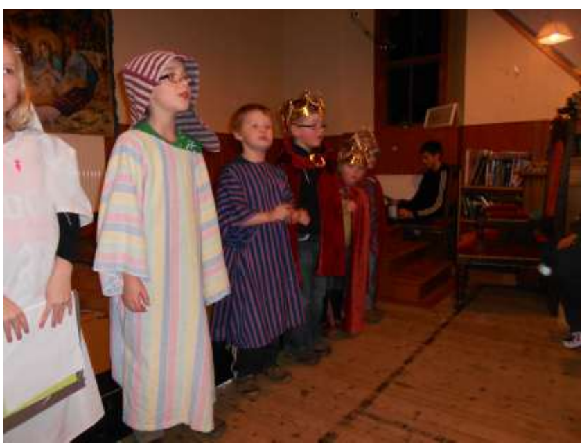
Page 5 of <u>The Stronsay Limpet</u> - Issue 79 January 2012