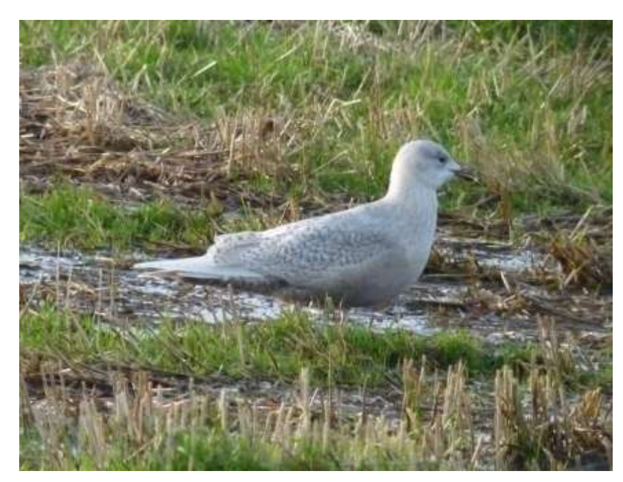
1st Winter Iceland Gull, Jan. 2012