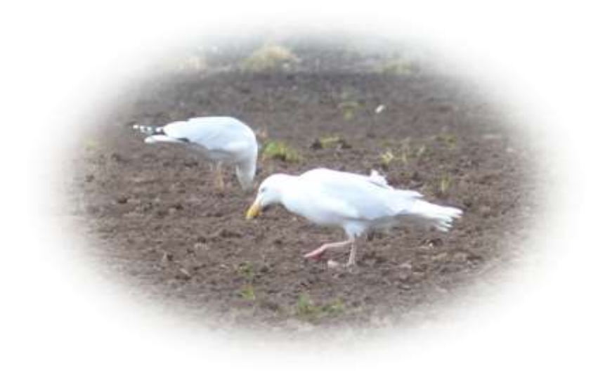
Adult Glaucous Gull (rt.), Spring 2008 note large size and heavy bill. (Herring Gull to right)

Small parties of Fieldfares and a few Redwings were still present in mid-Winter and these were boosted by a considerable influx of thrushes at the start of the fine, calm weather on 14th January. At least 500 Fieldfares were seen after this date and there was an interesting flock of 6 Song Thrushes near Holin Cottage on 16th. Single Greenfinch, Siskin, and 2 Chaffinches have been seen and a Dunnock which arrived in the Castle garden may have been the bird which had been over-wintering at Helmsley where a big area of the preferred habitat of this species was sadly destroyed in the mid-Winter storms.