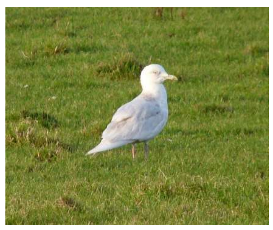
Adult Iceland Gull, Jan. 2012

The name Iceland Gull is a misnomer as the birds originate mainly from Greenland and Arctic Canada - but do not breed in Iceland! Glaucous Gulls (which do breed in Iceland) are very similar to Iceland Gull in all plumages but are generally noticeably bigger (Great Black-backed Gull size) and 'uglier', with a 'fierce' expression and a longer, heavier bill. (see photos - all taken on Stronsay)