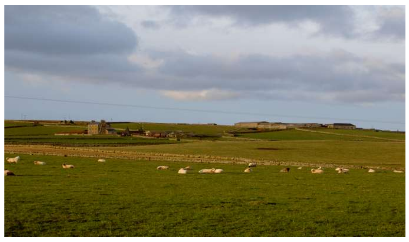
The Manse & Whitehall area 2012