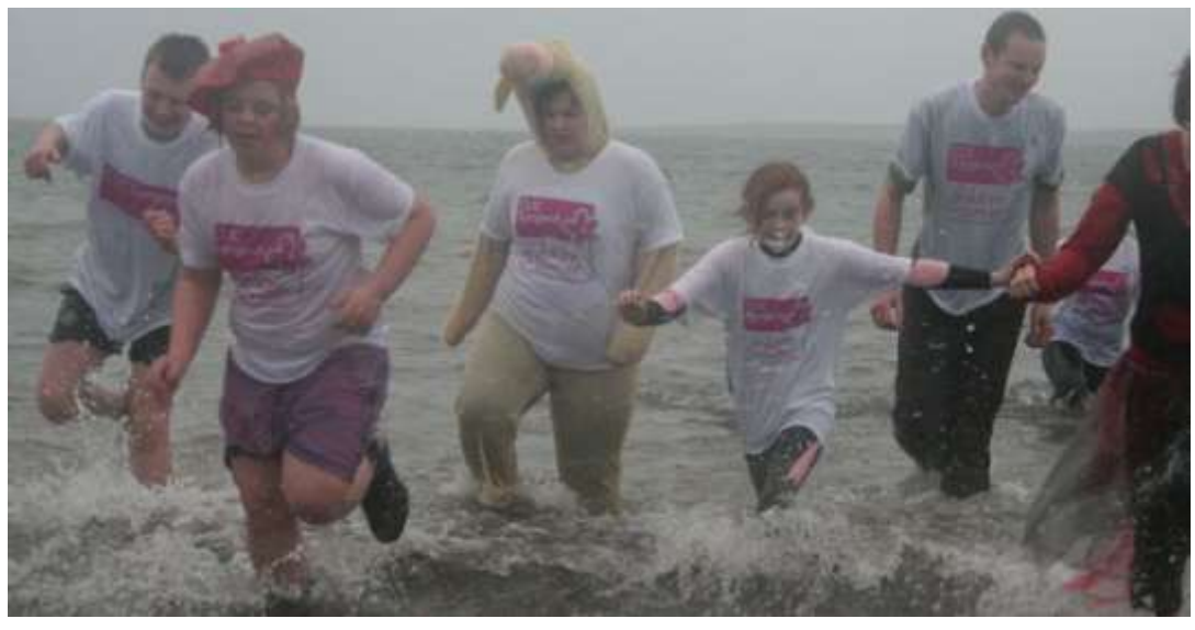
Page 10 of <u>The Stronsay Limpet</u> - Issue 79 January 2012