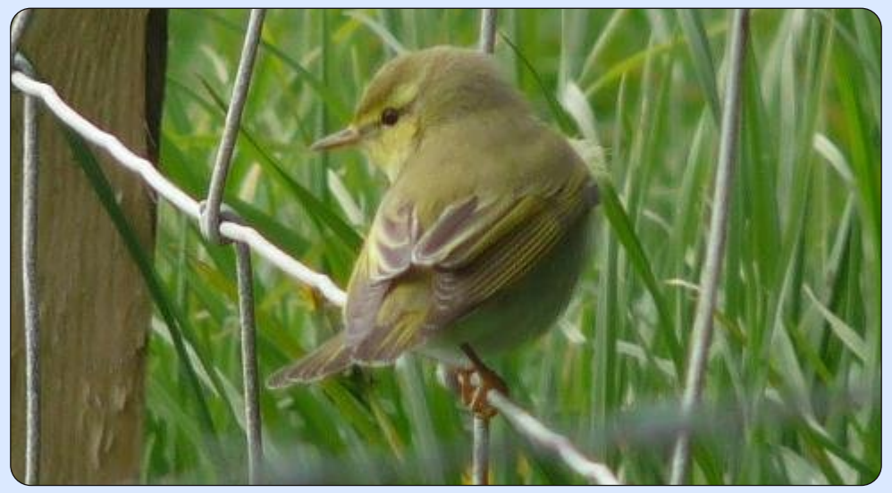
The very obliging Wood Warbler at Helmsley