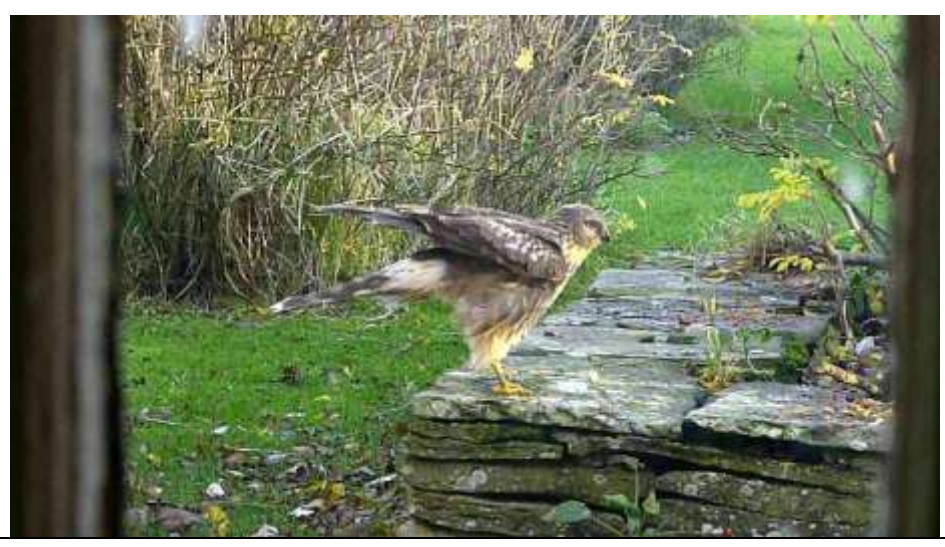
One of the Hen Harriers just a few feet from the front door at Castle'