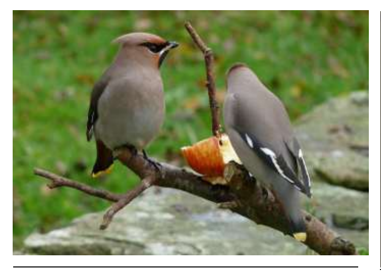
Two of the Waxwings in the Castle garden. Is there a more beautiful bird on the British List?