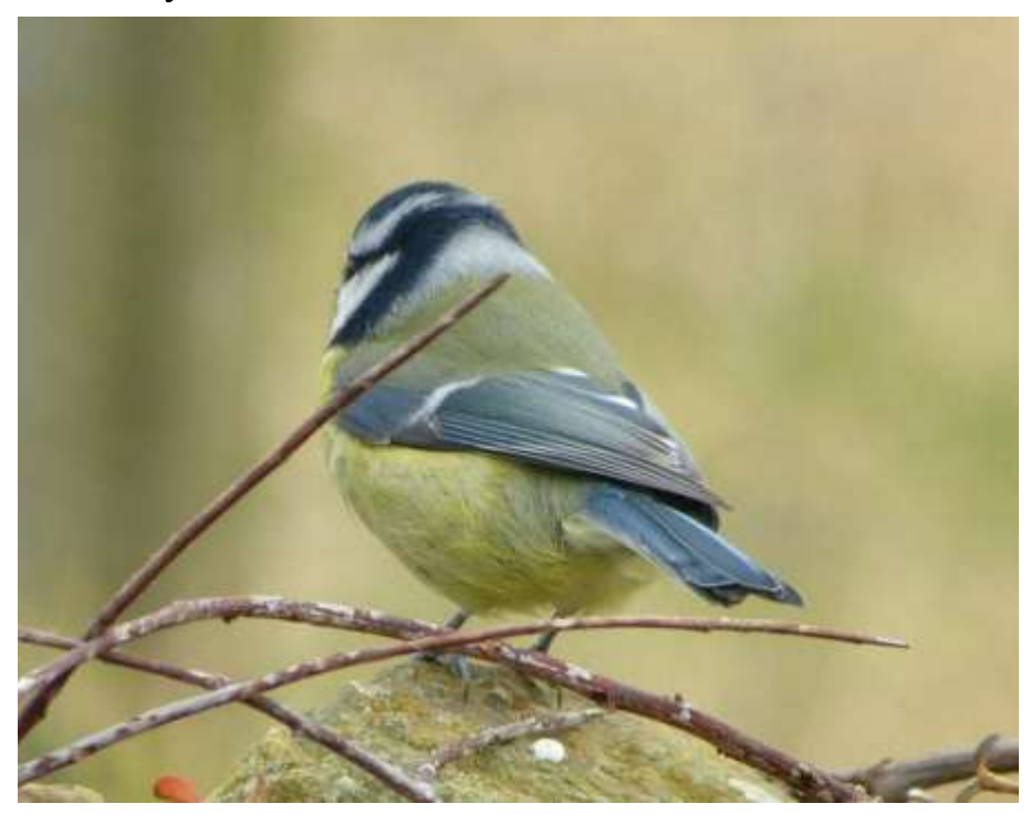
'Blue Tit at Dale 19th October. Subsequent sightings of the species at Castle, Sunnybank, and Northbank may all have been of the same bird.'