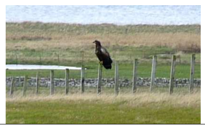
The Sea Eagle at Rosebank - the huge size and very short, broad tail gives this species a unique profile. Sadly the bird was only present for a short time before flying off northwards