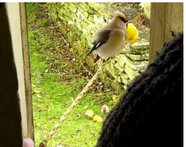
As ever the Waxwings were very tame this one tucking-in to an apple on the end of our hand-held toasting-fork by the back door