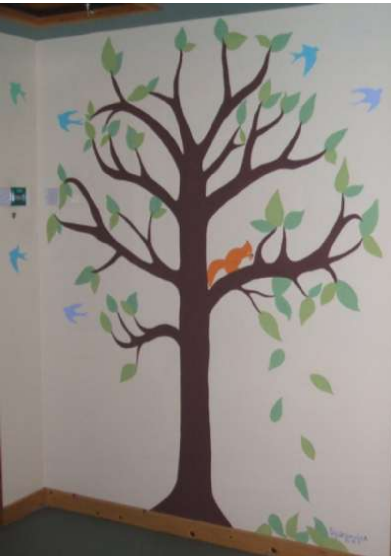
Page 7 of <u>The Stronsay Limpet</u> - Issue 89 November 2012