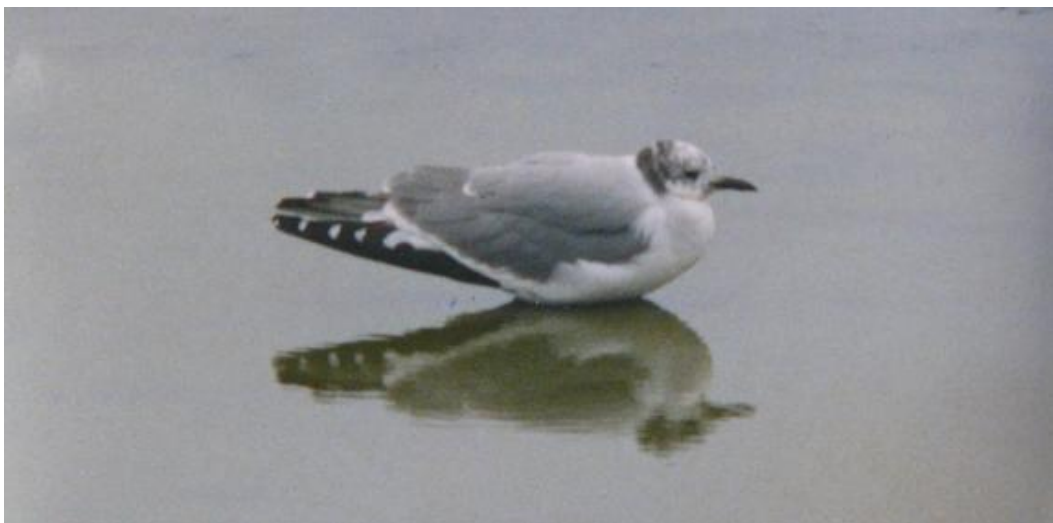
The same bird at the Waterworks Pond'

Also the second sighting for the island in the last 25 years, this male Snowy Owl was found by Harald Stout near the Airstrip in late March 2005. Very easy to spot in the open landscape, the bird spent two days in the area and was enjoyed by a steady stream of residents all eager to see this big, attractive species. Our own first view of the bird was particularly fortunate as it perched on the stone dyke just 100 yds from the Airport terminal (see photo). What was probably the same bird was discovered on Fair Isle - near the Airstrip - the following day.