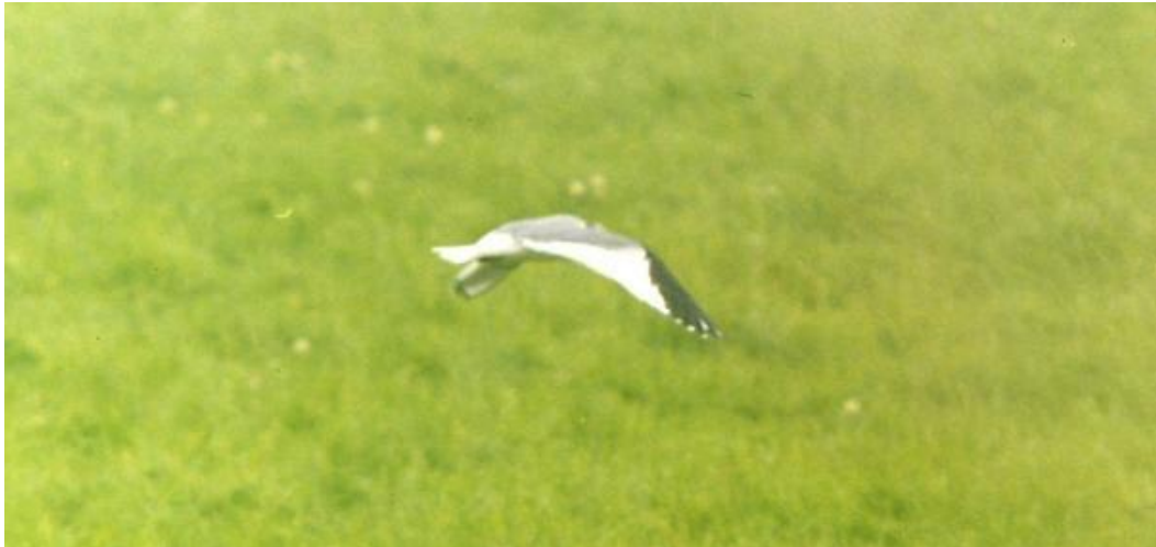
The adult Sabines Gull in flight at Hunton

The only other record for the island was one seen - and photographed - at The Pow in early October 1991 after a period of strong westerly winds.