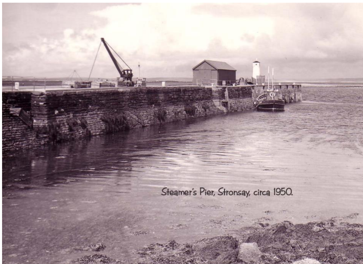
Steamer's Pier, Stronsay, circa 1950.