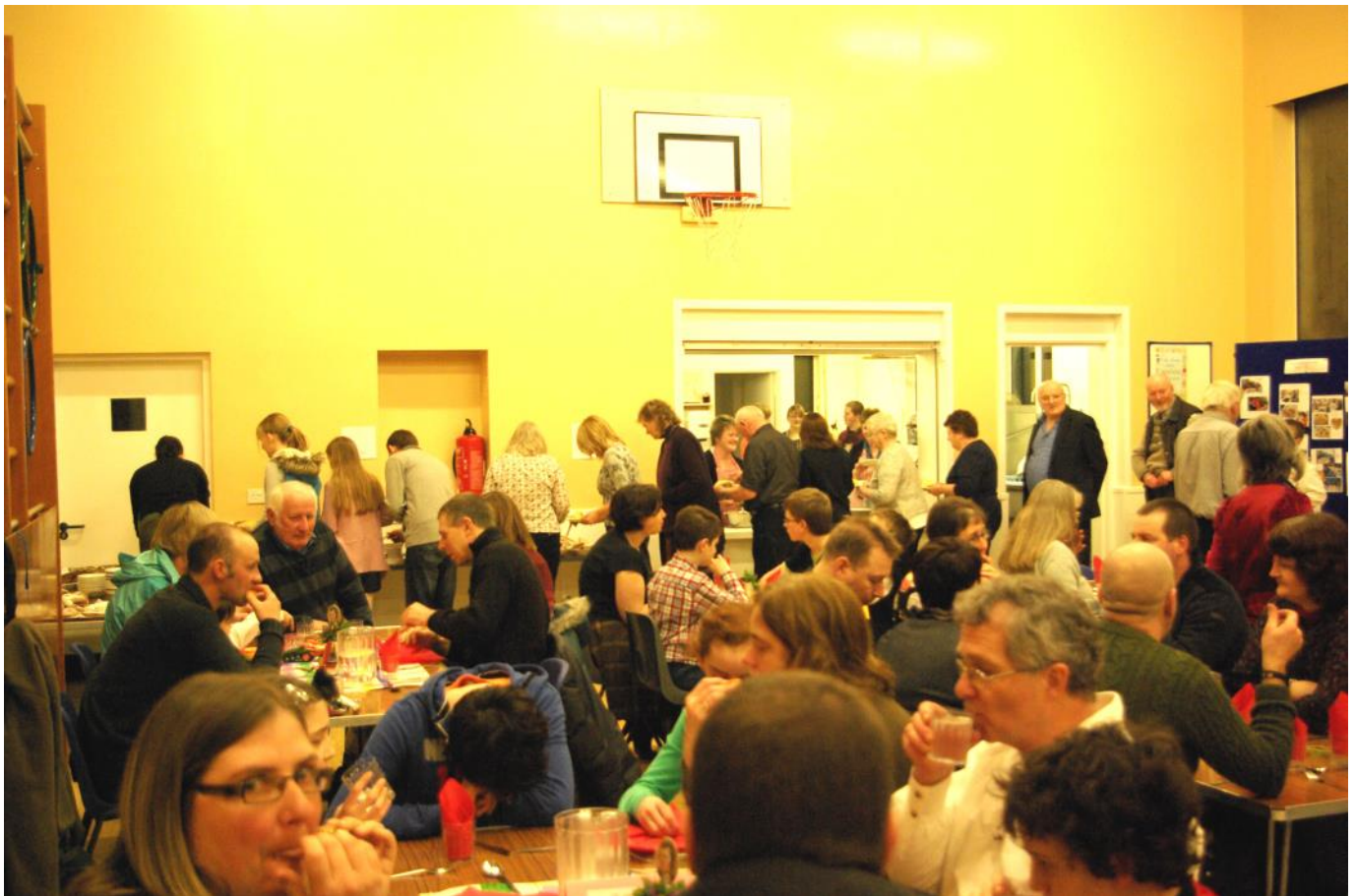
The locals enjoying the meal

A very good night was had by all who attended.