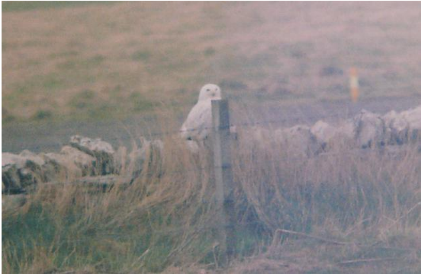
Snowy Owl on the stone dyke along the road to the Airstrip