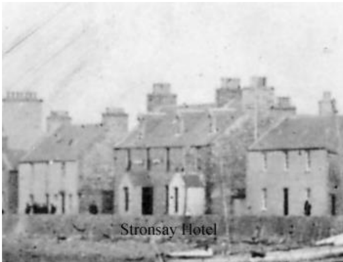
Old Stronsay Hotel