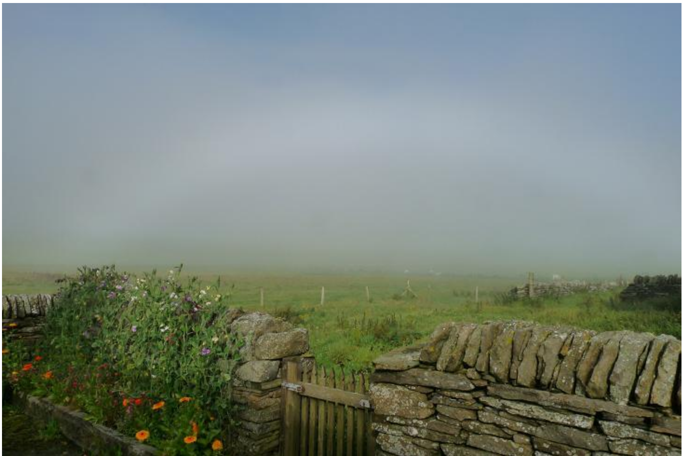
Rainbow from Castle - August 2012

Whilst many of us have been watching the skies at night recently in the hope of seeing meteors and the odd asteroid there was a very interesting sighting much lower down in the sky on Monday morning - a White 'Rainbow' - sometimes known as the 'Fogbow' - seen by ourselves at Castle and Nigel & Juliet at Lower Millfield. This weather phenomenon can be seen as fog begins to clear and the few we have seen here have all been with our backs to the sun (as per a normal rainbow) and all around 9am. They are not as obvious as coloured rainbows but once detected, the even, white arc - slightly thicker than the coloured variety - becomes quite distinct and as with the ordinary rainbow, the 'feet' may be seen firmly 'attached' to the ground. Kath and Norman have seen many at Dale over the years around the same time of day, and Sheila Burger informs us that she has been lucky enough to see one at night whilst camping in France.