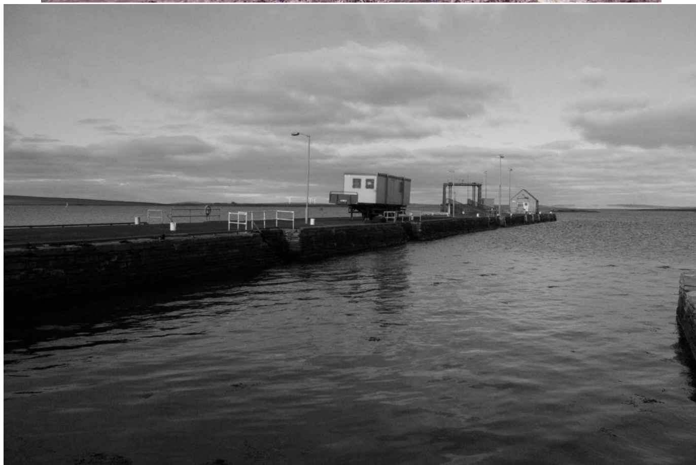
Steamer's Pier 2013