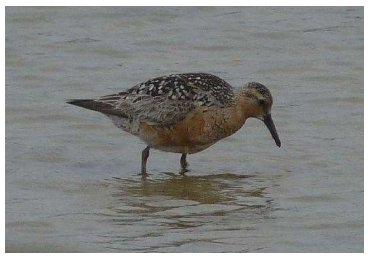
One of the Knot in full summer-plumage at the Bu Loch in early August'

The Bu Loch has attracted a good mixture of wading birds throughout the last four weeks - mainly Dunlin, Knot and Black-tailed Godwit, the majority in summer-plumage - whilst at the Matpow Loch there have been regular but brief sightings of 2 different Ruff and a Greenshank, and on 3rd August 3 Green Sandpipers together. Single Green Sandpipers (quite rare here) were also seen at two sites on 9th August - possibly the same bird?